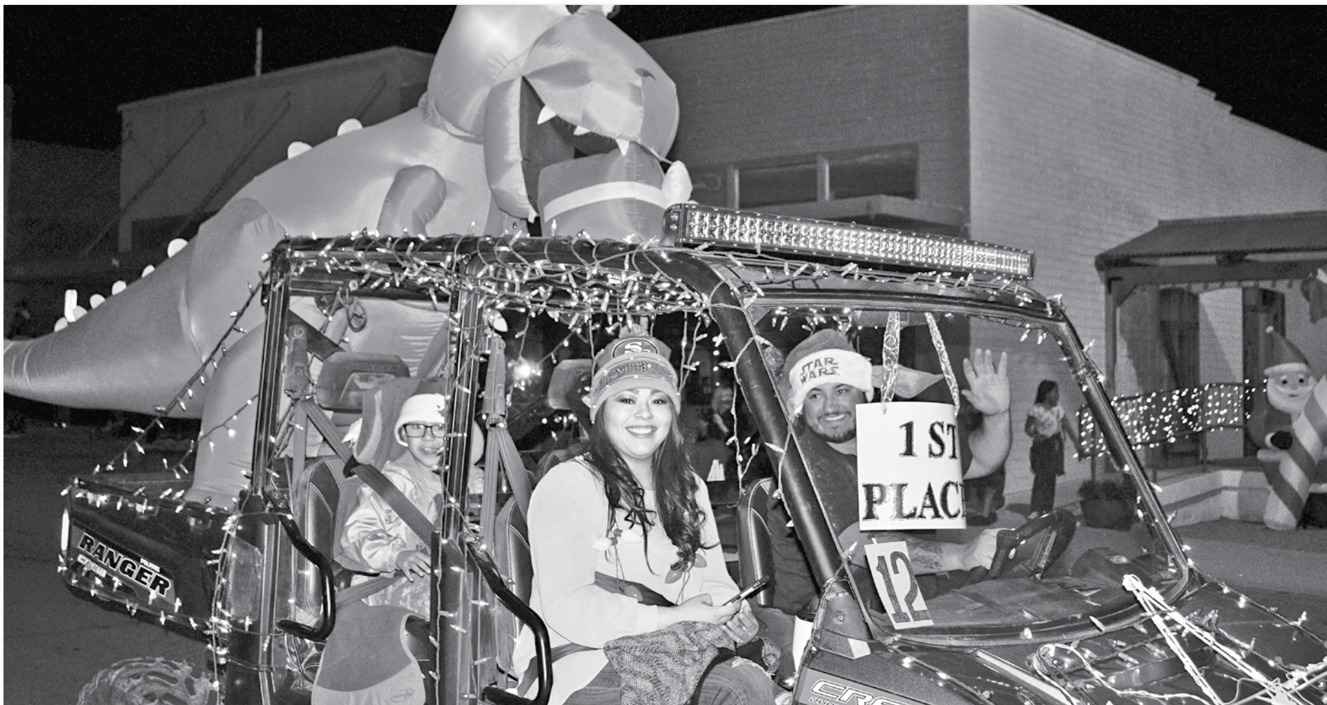
Fabulous light parade entries from last year's Miracle on Main St,