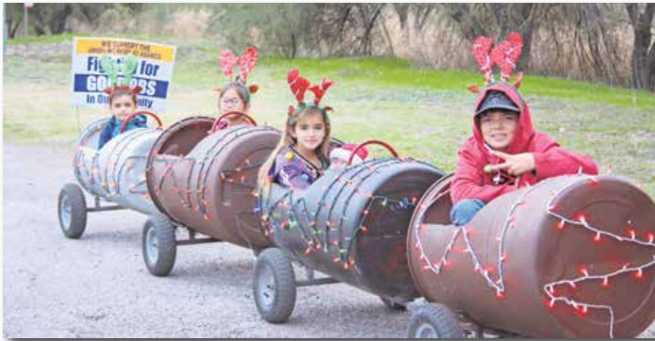
Sanchez Ranch entry.