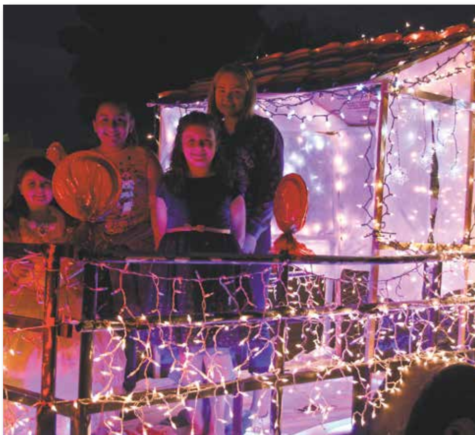
Buzzy's Drive In.