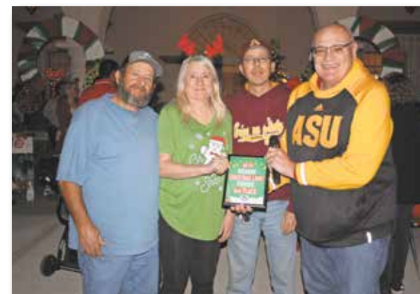
Eddie Tire receives their second place plaque in the parade.