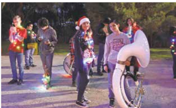
Ray High School Marching Band.