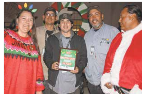
Apache Sky receives their first place plaque.