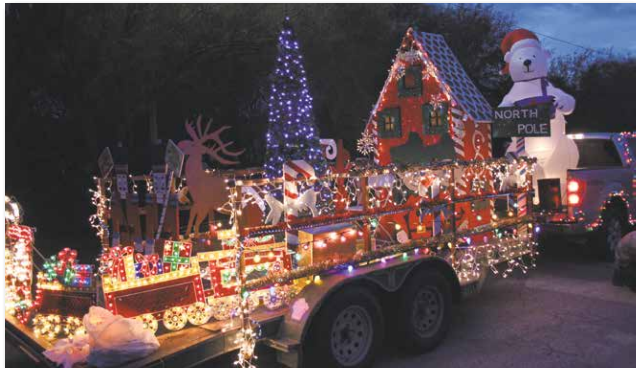
Apache Sky Casino's parade entry.