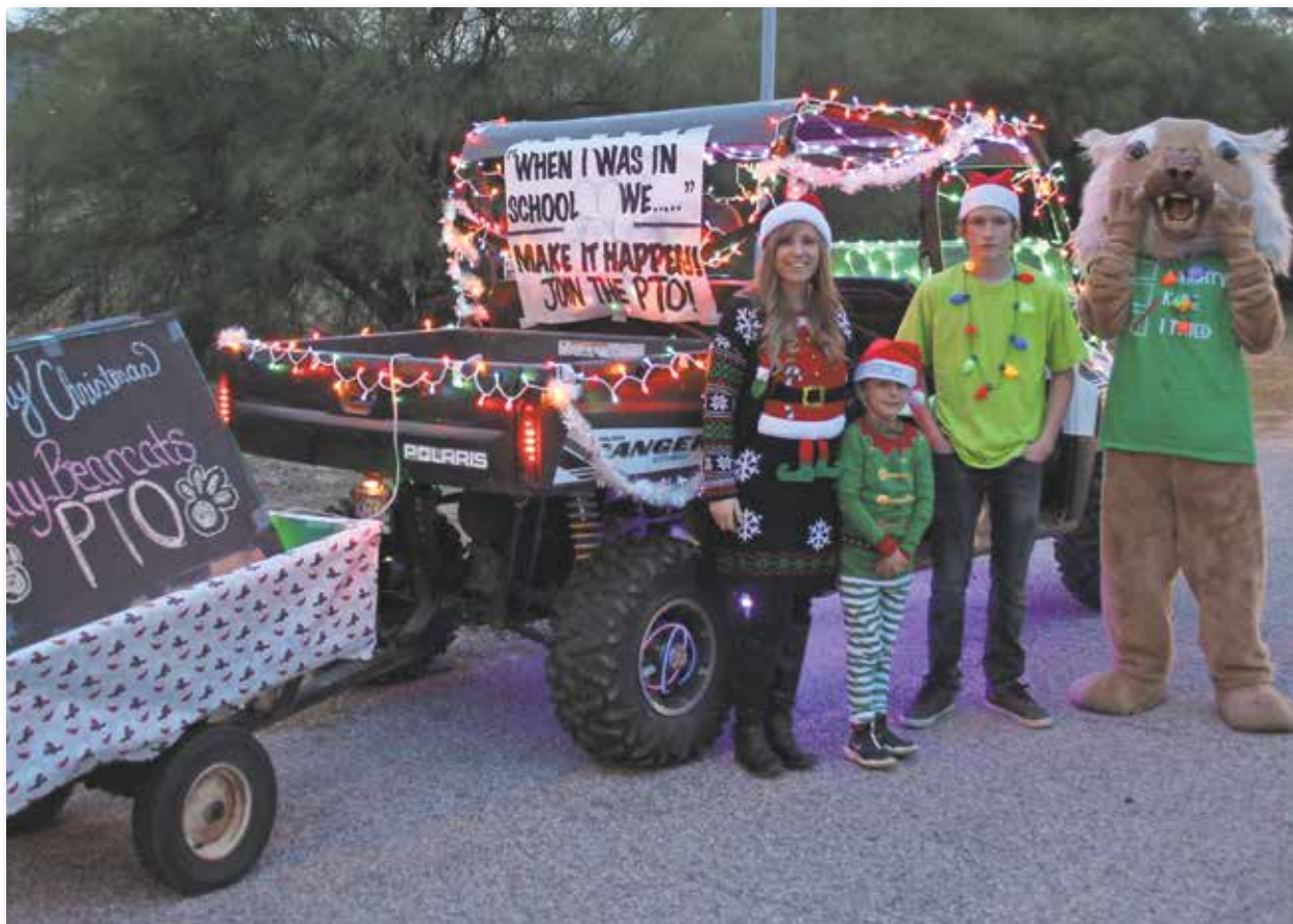
Ray Bearcats PTO.