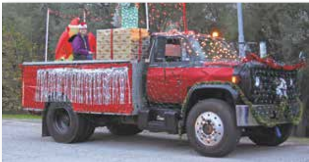
Kearny Glass & Automotive.