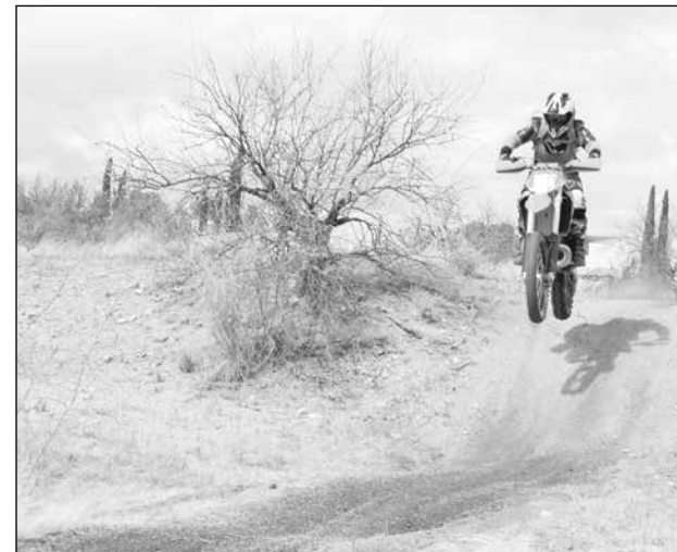
A rider goes airborne during the 2013 Copper Classic. (File photo)