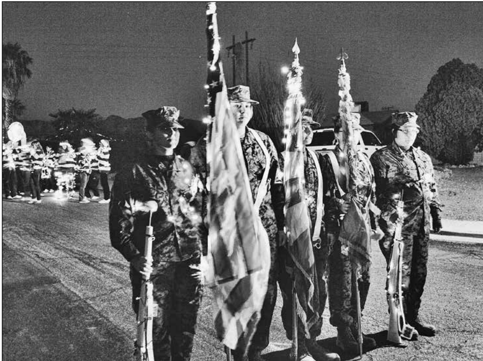
Ray High School ROTC serves as the color guard for the electric light parade. The Ray High School band followed them.