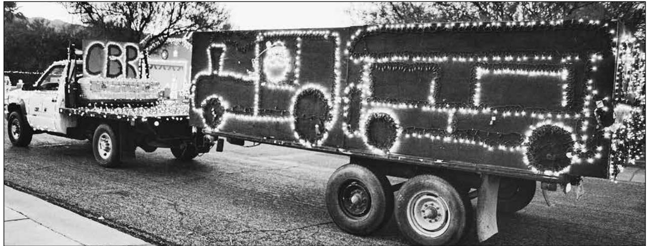
Copper Basin Railway