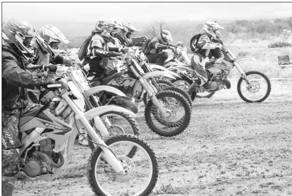
And the riders are off. The start of the 2013 Copper Classic. (File photo)