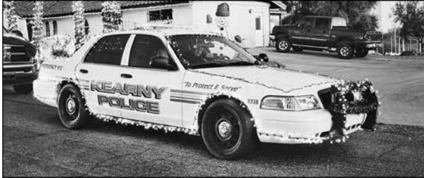
Kearny Police Department

It also heralded the opening of the Christmas season for residents of the Copper Basin Area with the arrival of Mr. and Mrs. S. Claus with help from the pilots of Native Air and the volunteers of the Kearny Fire Department. Children of all ages were able to tell the famous couple all of their Christmas dreams and wishes.