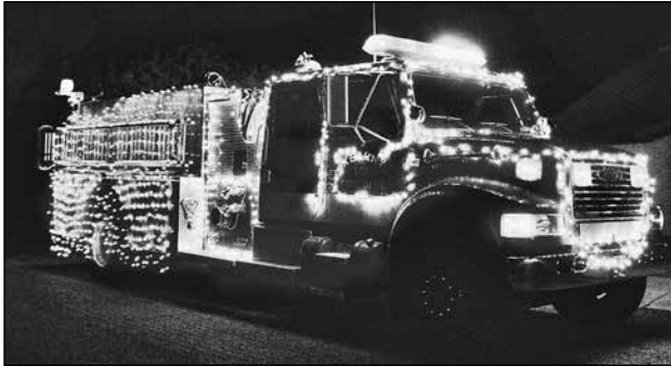
Kearny Volunteer Fire Department