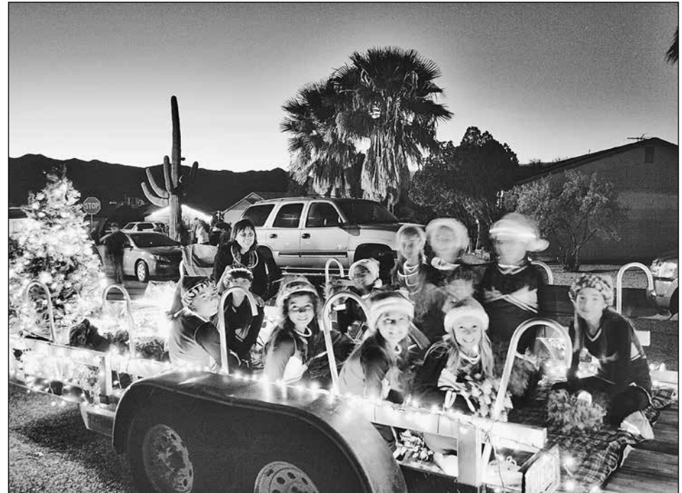
The Ray Junior High School Cheerleaders brighten up their float during the Winter Wonderland Electric Light Parade.