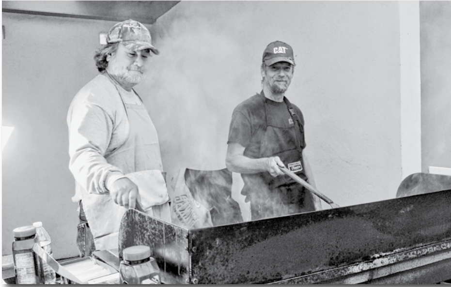
Feeding the masses.

The event would not have happened without the support of many sponsors and volunteers. The Superior Junior High Student Council stepped up to help this year. The group helped with decorating the park, filling the goody bags and helped on the day of the event.