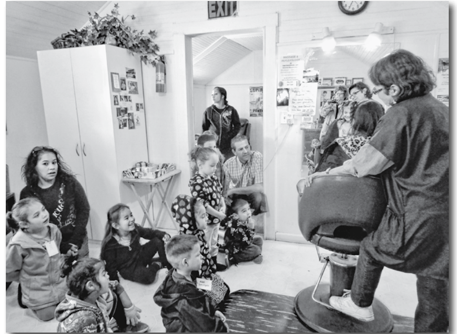
Superior Head Start preschoolers visited Superior His & Her Hair Salon on a walking field trip.