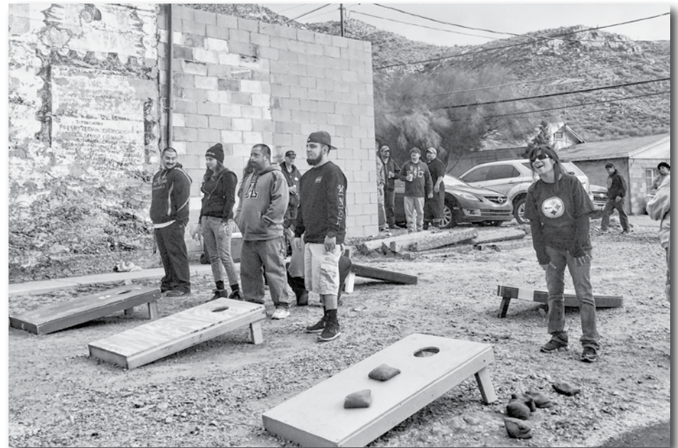
The Cornhole Tourney was very popular.