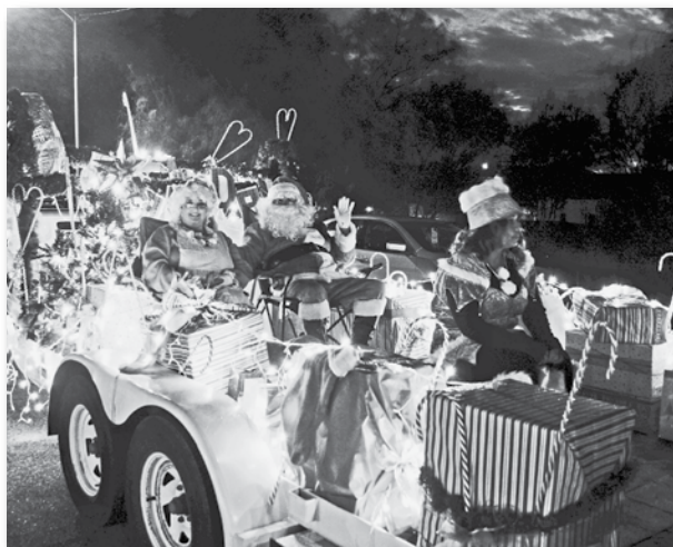
On the cover: Santa & Mrs. Claus arrive in style.

A special award was given to the Ray High School Band for "staying in Kearny for the parade."