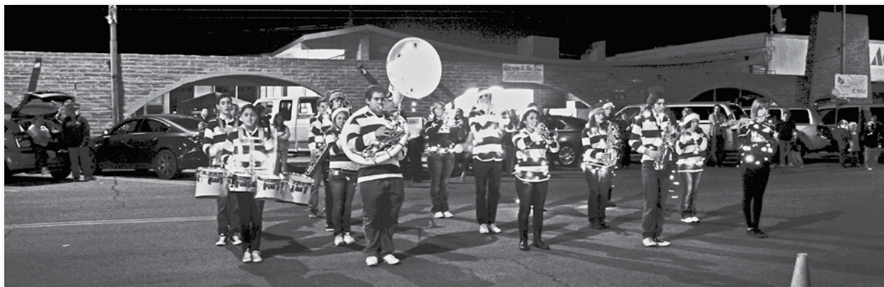
Ray High School Band