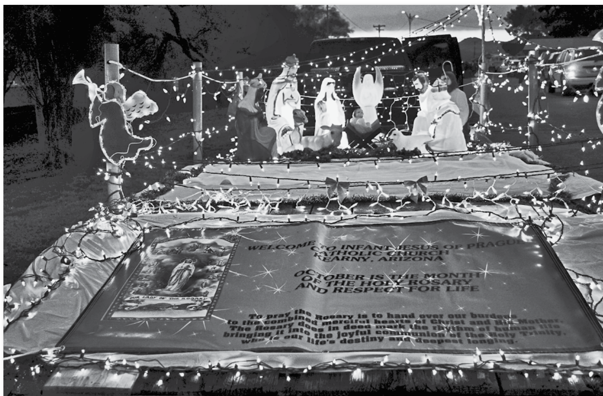
Infant Jesus of Prague's parade entry.