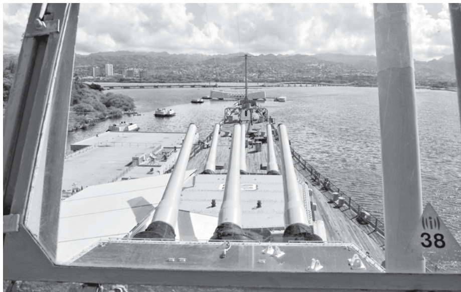
A view of the Arizona Memorial from the bow of the USS Missouri.

socially. On that Sunday 2,403 Americans were killed and 1,178 wounded. Now Pearl Harbor, besides being an active naval base, is part of the National Park Service and features a visitor's center and museums.