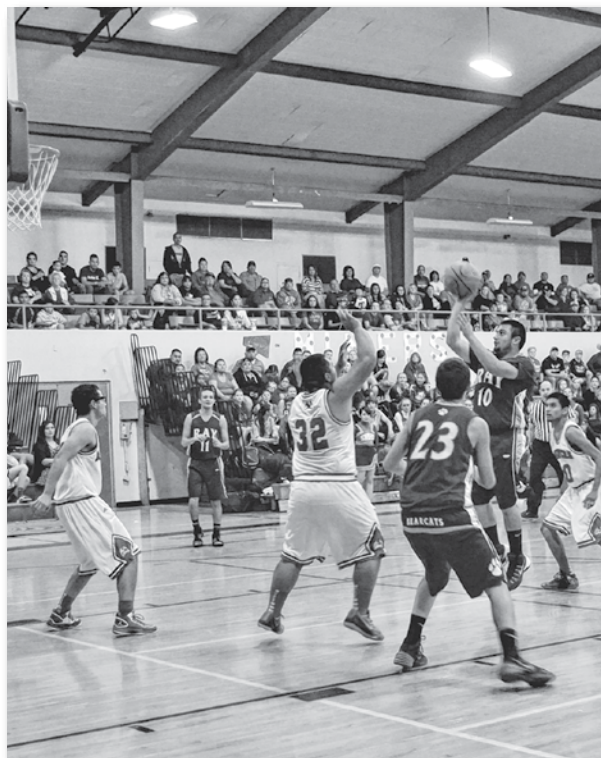
A Ray cager shoots during last week's win over San Manuel.