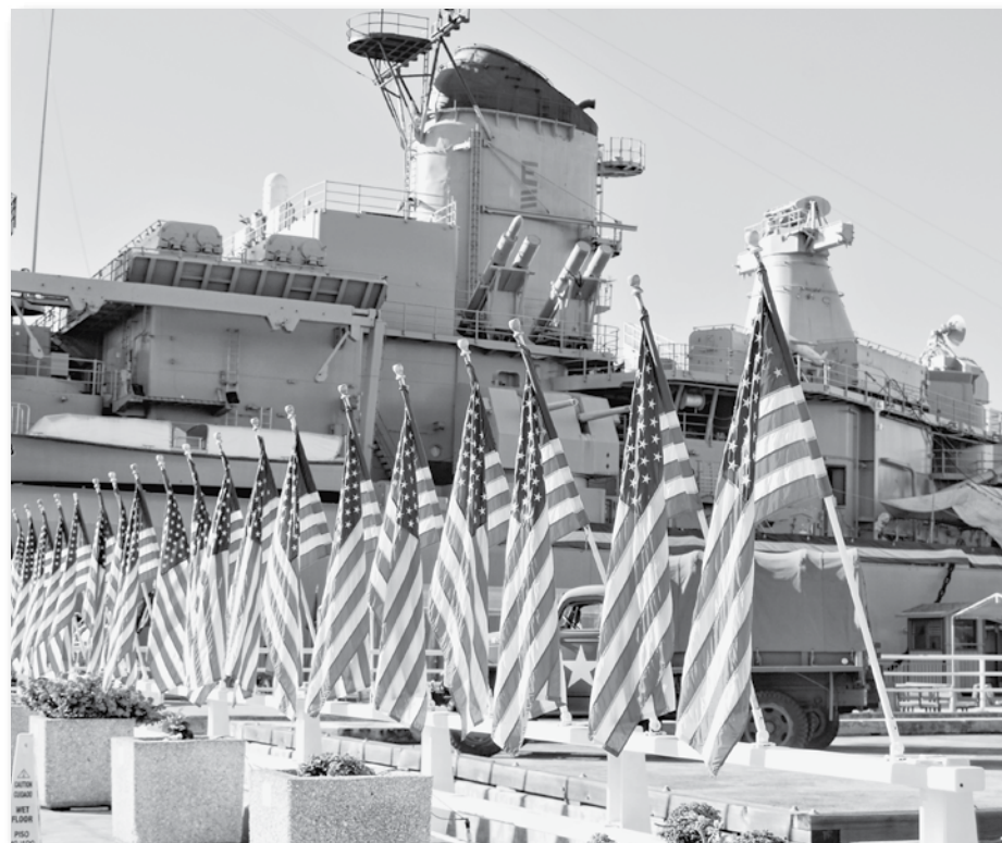
The USS Missouri is docked in Pearl Harbor.

*Minimum 24-month service term. Customers who use greater than 150 GBs of data/mo may be contacted and given option to reduce usage or transition to another plan per Bandwidth Usage Policy at www.exede.com/legal . Service for residential and non-commercial use only. Limited time offer.