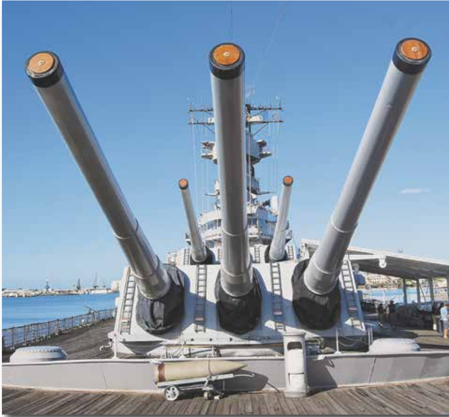
Though no longer operational, the guns on the USS Missouri are still impressive.