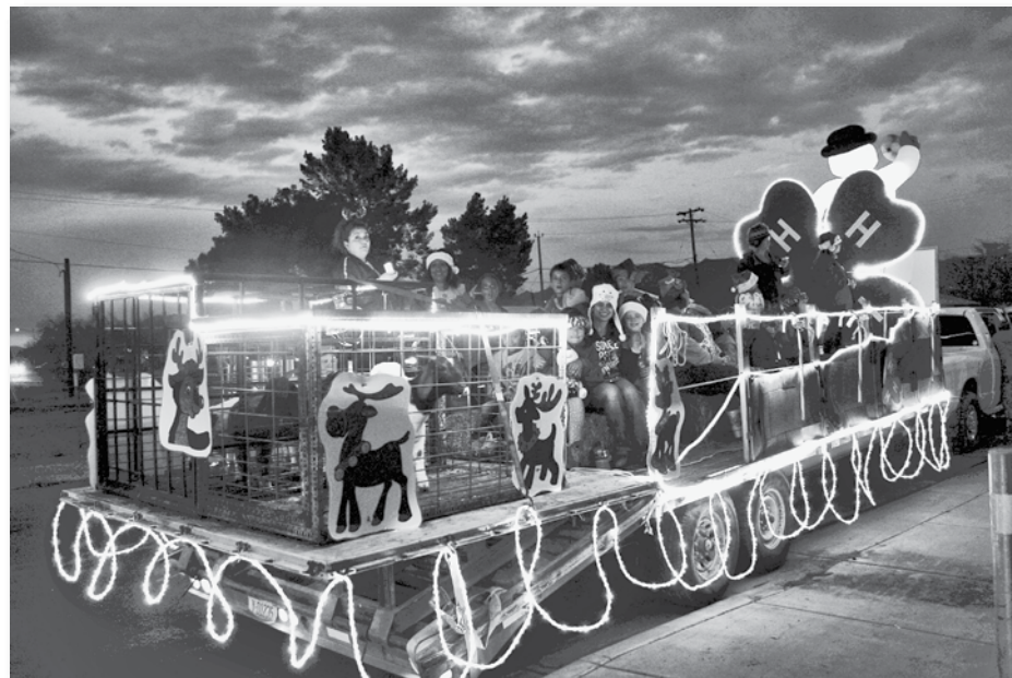
Kearny Koyotes' parade entry.