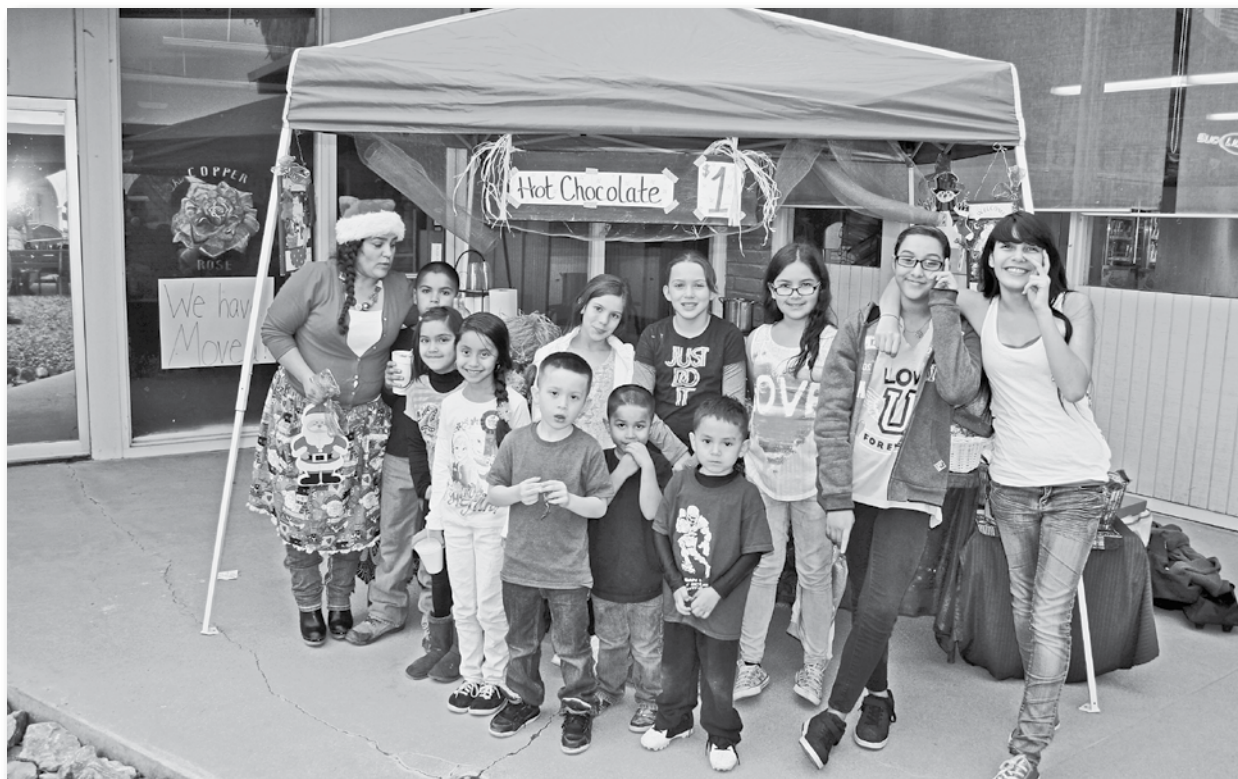
Hot chocolate for sale.