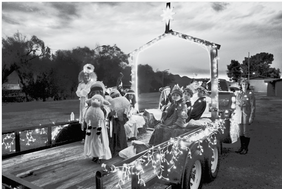
Eddie Tire's parade entry.