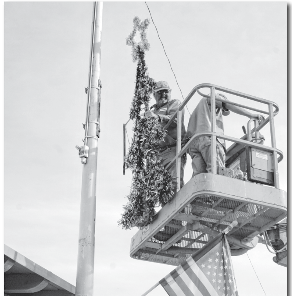
They weren't up on the housetop and they didn't use a 'suchak ladder,' but the Town of Kearny employees did add a festive touch to uptown earlier this month when they put up the annual street light decorations. (And points for those of you who know what poem the ladder is in.)