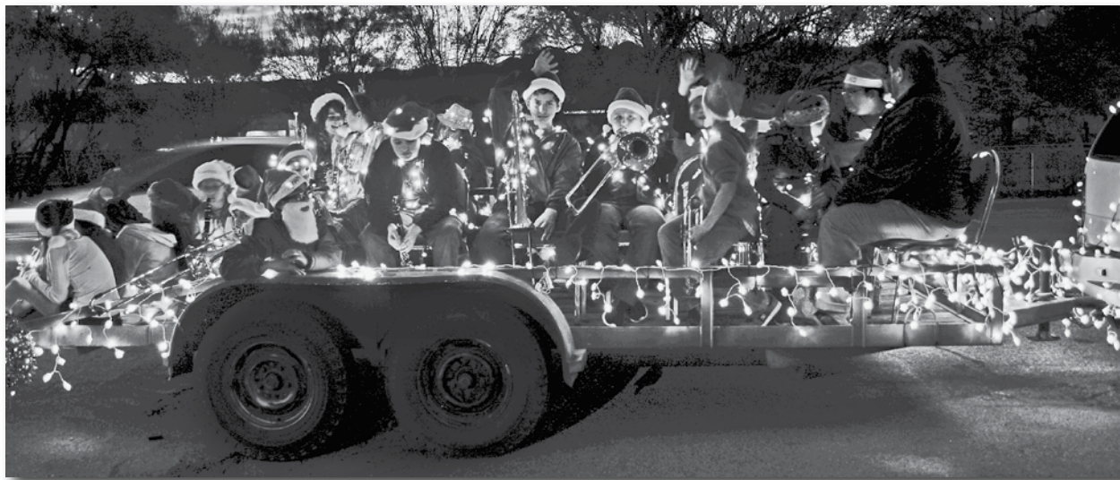
Ray Elementary Band