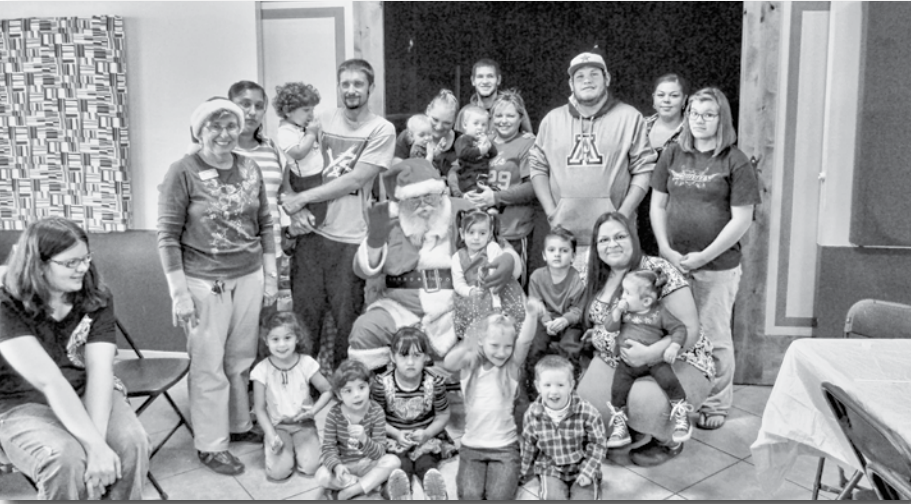
Santa made a stop at Family First Children and Parents Christmas Party which was held at Living Word Chapel.

Having recently paused for the Thanksgiving