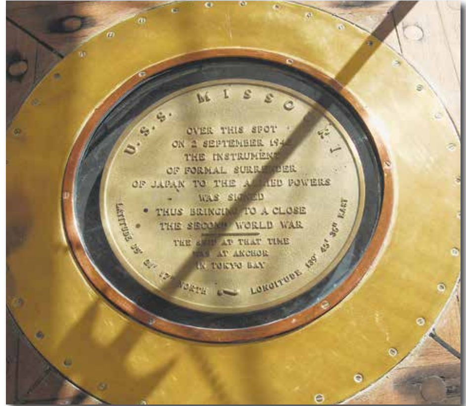
The spot that marked the end of WWII.