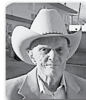
with the funeral service following at 11 a.m.

Memorial services will be held on Saturday, Nov. 11, 2017 at the Fellowship Baptist Church in Kearny. Visitation will be at 10 a.m.