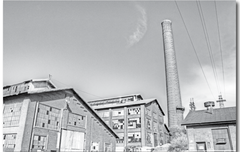
The Historic Magma Copper Smelter Complex in Superior. The stack is set to be demolished this weekend.

SUN LIFE ACCEPTS MOST MAJOR INSURANCES. INCLUDING AHCCCS, MEDICARE AND TRICARE. NO INSURANCE NEEDED FOR $3.99 GENERICS.