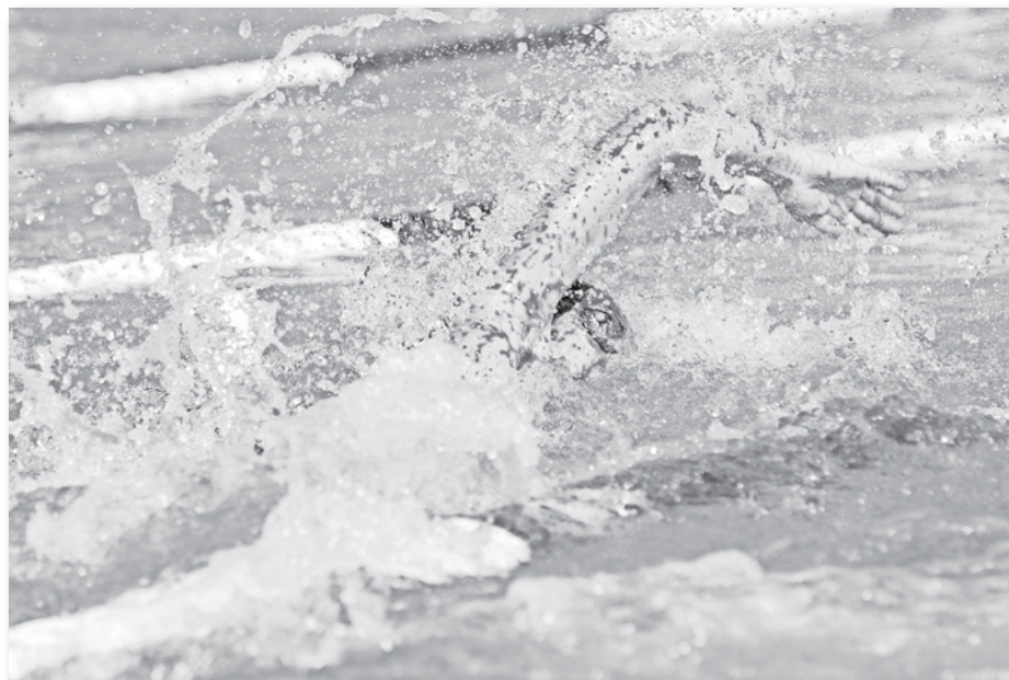
Michael, Primero-Predgo placed 13th in the 50 Free and 14th in 100 Free.