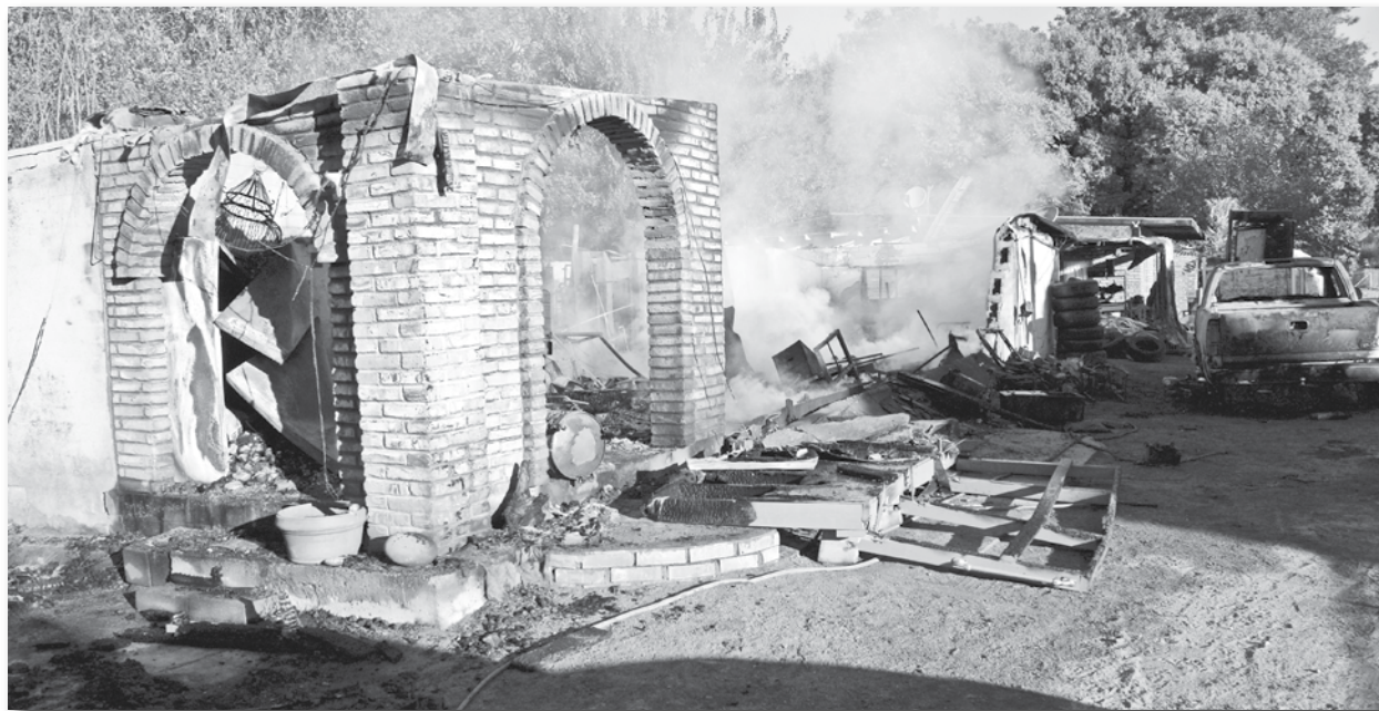
This home in Dudleyville was destroyed in an early morning fire last week.

The family is in need of some financial support as they rebuild their lives. There is a Go Fund Me page set up for the family. You can donate online: https://gf.me/u/y6p8p2 . There are also fundraisers being planned.