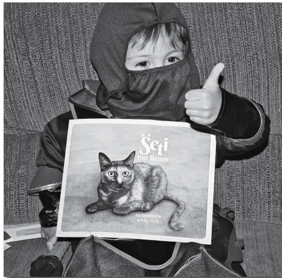
Even Ninjas give Seti a thumbs up!

MINER Legal 10/21/20, 10/28/20, 11/4/20, 11/11/20