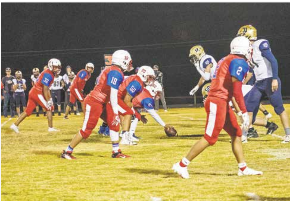
Miners line up on offense.