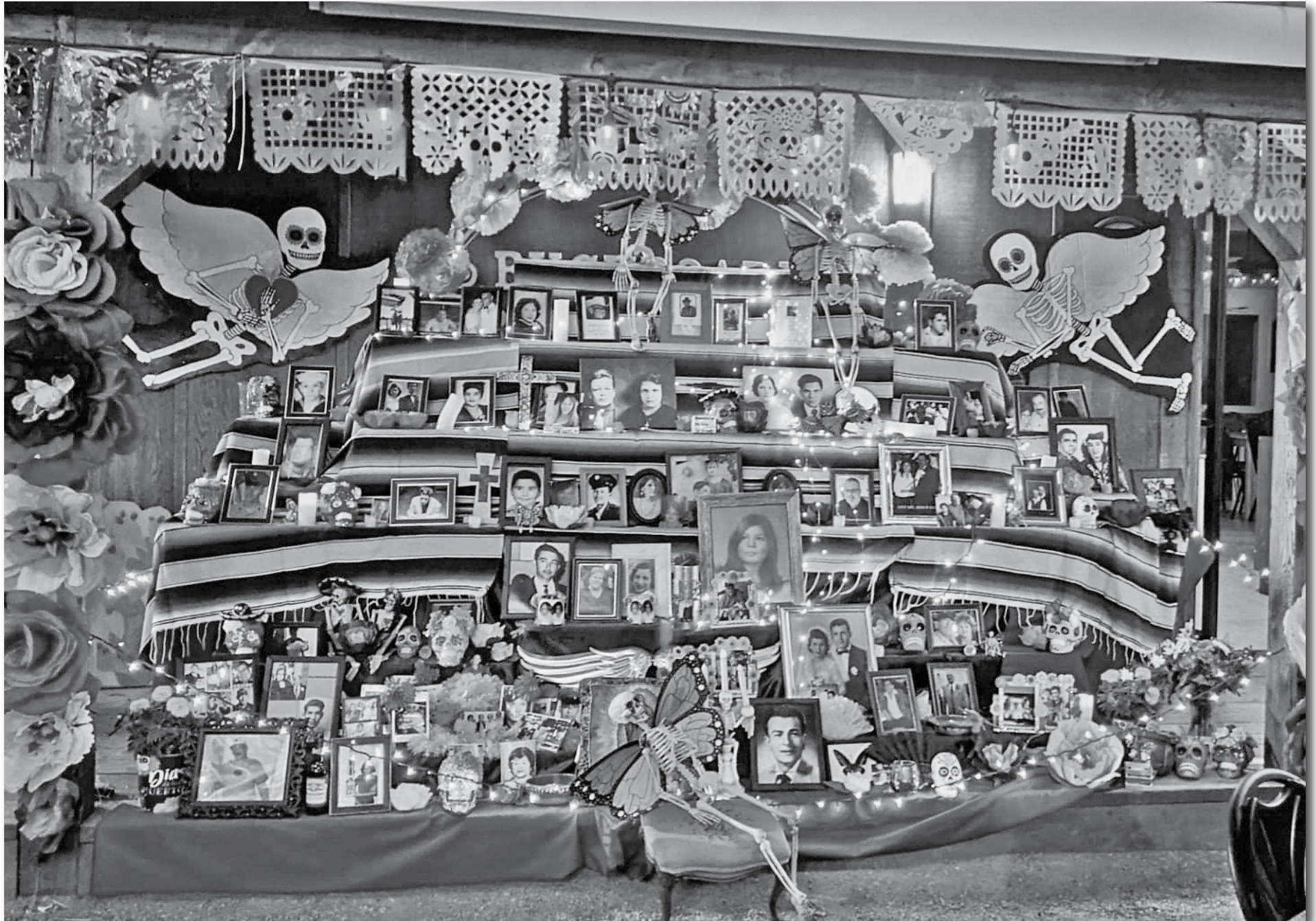
A community offrenda on display at Superior's first Dia de los Muertos event.