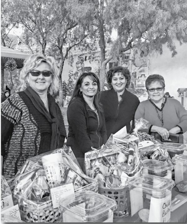
Are you ready for Miracle on Main St.?

will be giving away Free Hot Chocolate and there will be a s'mores station starting at 6:30 p.m. All of the events and activities are free including the photos. Santa will be arriving at the Besich Park following the parade. Food booths and raffle booths will also open at 3 p.m.