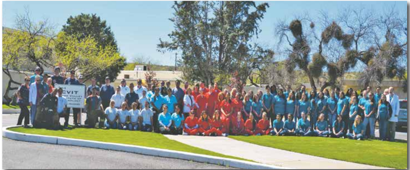
Students who completed CVIT programs in the 2015-16 school year.

Two years ago Superior began the hospitality program in efforts to prepare students for work at the Magma Hotel