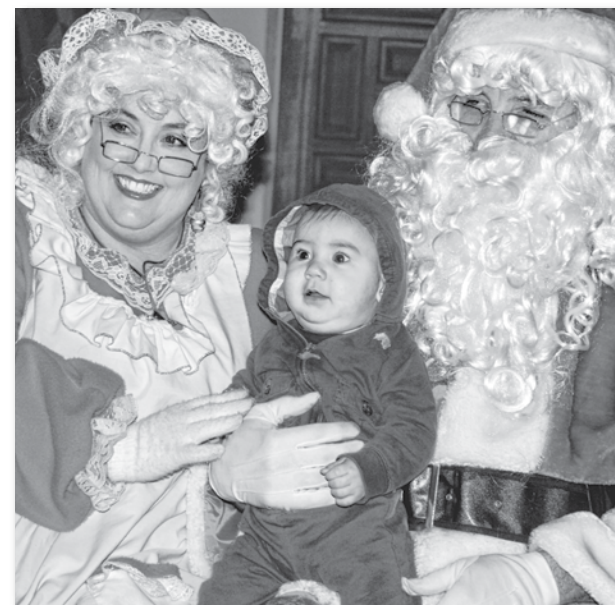
Santa and Mrs. Claus will visit with youngsters on Saturday during Winter Wonderland.

The parade line up is at the area by the Teen Center with smaller floats lining up in front of Kearny Town Hall and larger floats will line up on Jamestown starting at 5 p.m. with the parade starting at 6 and ending at the GKI.