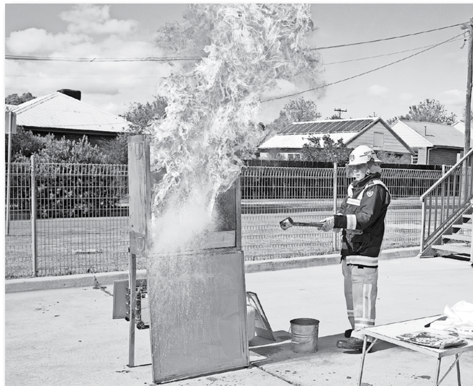
Kitchen oil fire demonstration, showing the boilover when incorrectly using water to extinguish a grease fire.