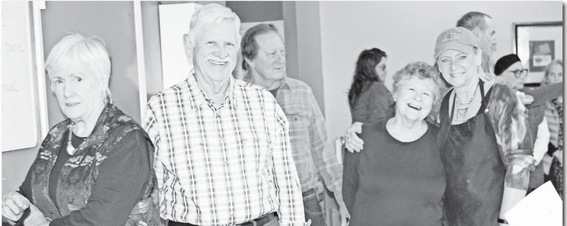
The Oracle Community Center hosted a Thanksgiving potluck on Saturday, Nov. 23. It was open to the public and many turned out for the event. The food was delicious!