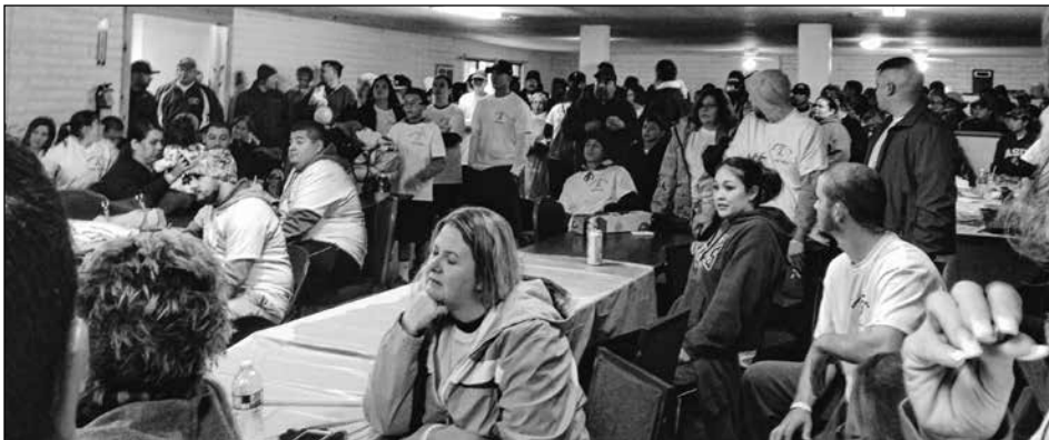
Walkers for the first Walk to Win event wait for the festivities to begin.