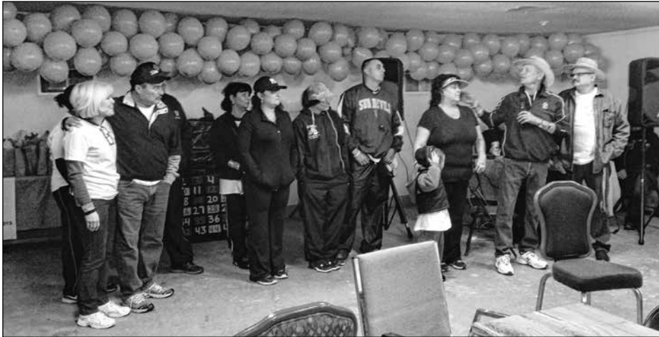
Organizers for the first Walk to Win event welcome the walkers Saturday.