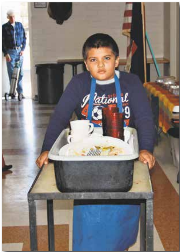
Here are the unsung heroes, those in charge of that dratted thing – CLEAN UP.