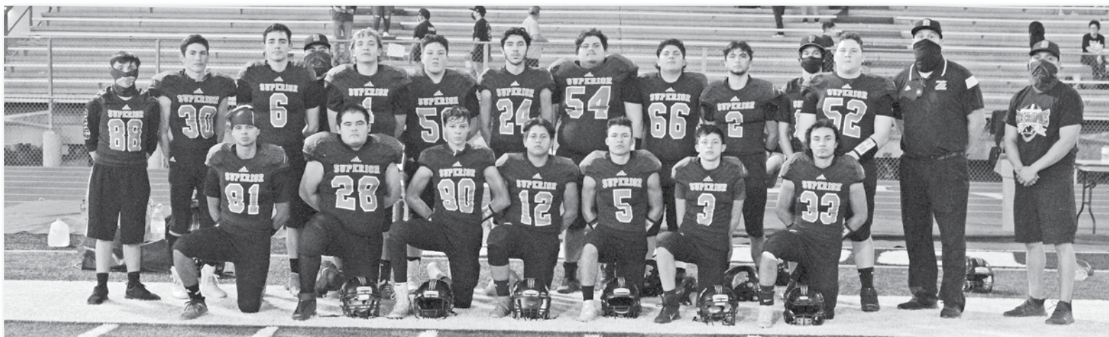
The 2020 Superior Panthers Football Team.

If the players make that commitment, the Panthers return to the state championship game will be sooner than later.