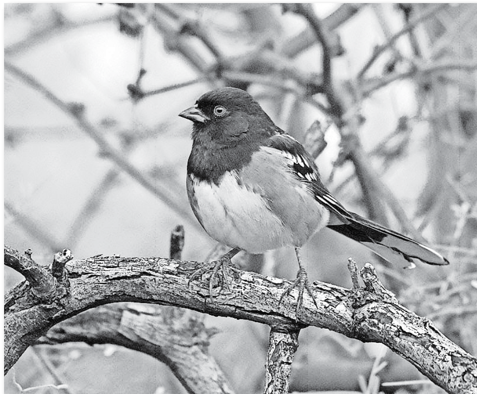
Spotted Towhee seen at the Oracle State Park.