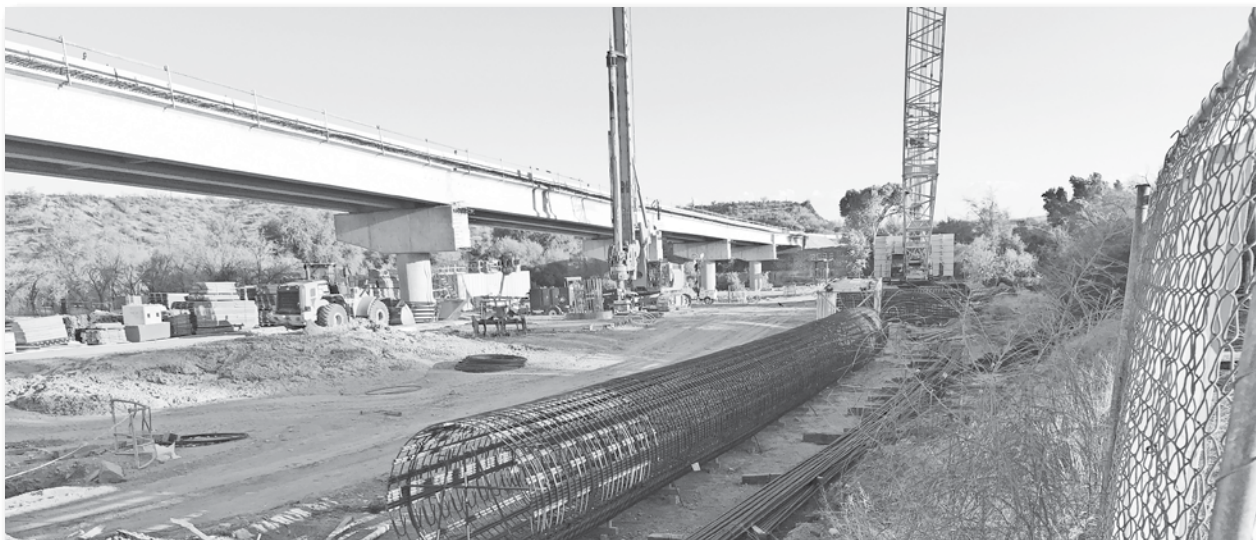
Construction has steadily progressed on the Winkelman Bridge. Starting next week, bridge girders will be installed.

Schedules are subject to change based on weather and other unforeseen factors. For more information, please call the ADOT Bilingual Project Information Line at 855.712.8530 or go to azdot.gov/contact and select Projects from the drop-down menu. For real-time highway conditions statewide, visit ADOT's Traveler Information Site at www.az511.gov , follow ADOT on Twitter (@ArizonaDOT) or call 511, except while driving.