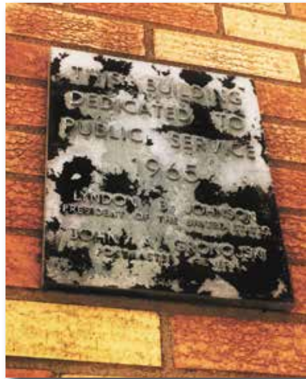
Superior Post Office was dedicated in 1965.

On Oct. 28, 2015, the Superior Post Office building turned 50 years old. The post office used to be across the alley from the bank on Main Street before moving to its