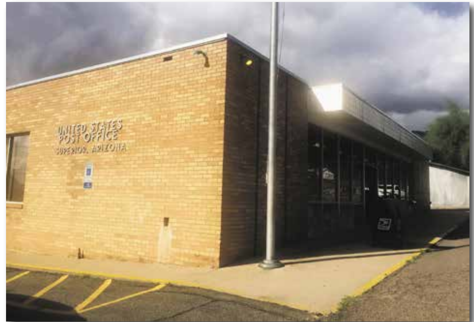
Superior Post Office turns 50 years old this year.