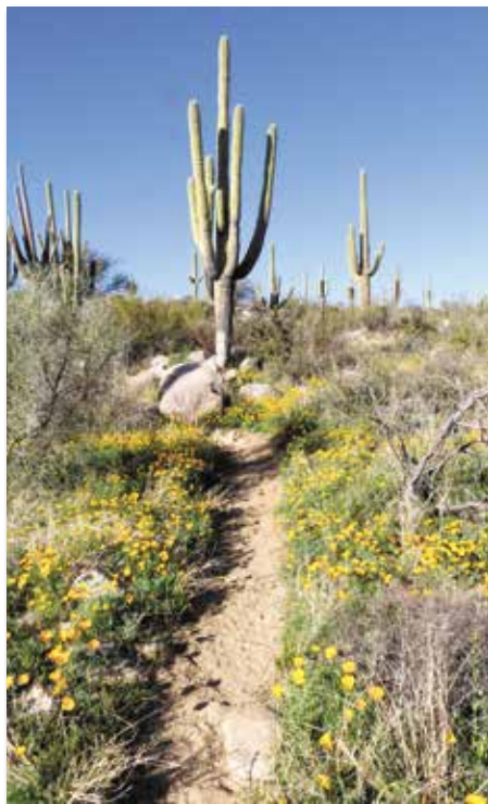
Why not enjoy the beauty of Arizona's wonderful falls at a state park on Black Friday?

(Phoenix, AZ - November 19, 2015) - In collaboration with outdoor specialty retailer REI, Arizona State Parks invites Arizonans to #optoutside on Black Friday! Visit an Arizona REI store from November 21-25, 2015 and receive a free day pass for entry into an Arizona State Park. There are four REI stores in Arizona: Flagstaff, Paradise Valley, Tempe, and Tucson.