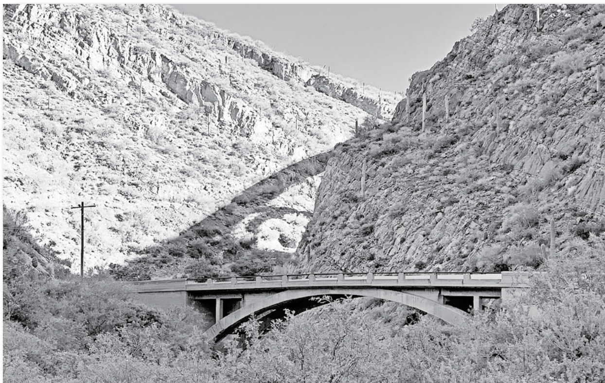
The old bridge over the Queen Creek near Superior. The shadow of the current bridge looms. In a couple of years there will be three bridges.

A brief ceremony at the US 60 bridge on the trail is also planned.