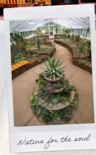
Nature for the soul

Kick off the holiday season by shopping local in Superior! Embrace what makes Superior different and seek it out. Give the gift of art with either a one-of-a-kind piece by a Superior artist, an art workshop or a unique antique piece. There are plenty of delicious local eateries here that will keep your belly happy while you shop and you can pick up a gift card for a loved one! Gift a special experience which there is no shortage including membership to Boyce Thompson Arboretum, jeep tours, UTV adventures, spa treatments and local wine tastings. Browse boutique shops for something unique such as hiking goods, pillows, games for the kids and that perfect new outfit. There is something for everyone on the list! By supporting the small businesses in our community we are building a stronger and more resilient town together.