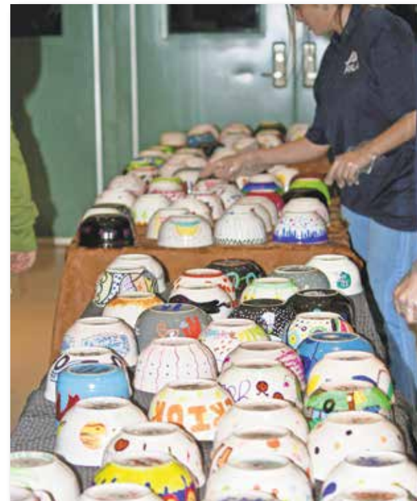
Bowls handcrafted by FBLA.