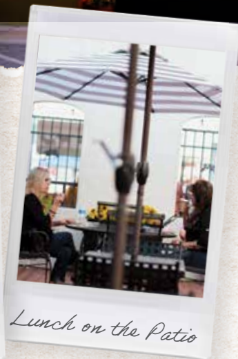
Lunch on the Patio