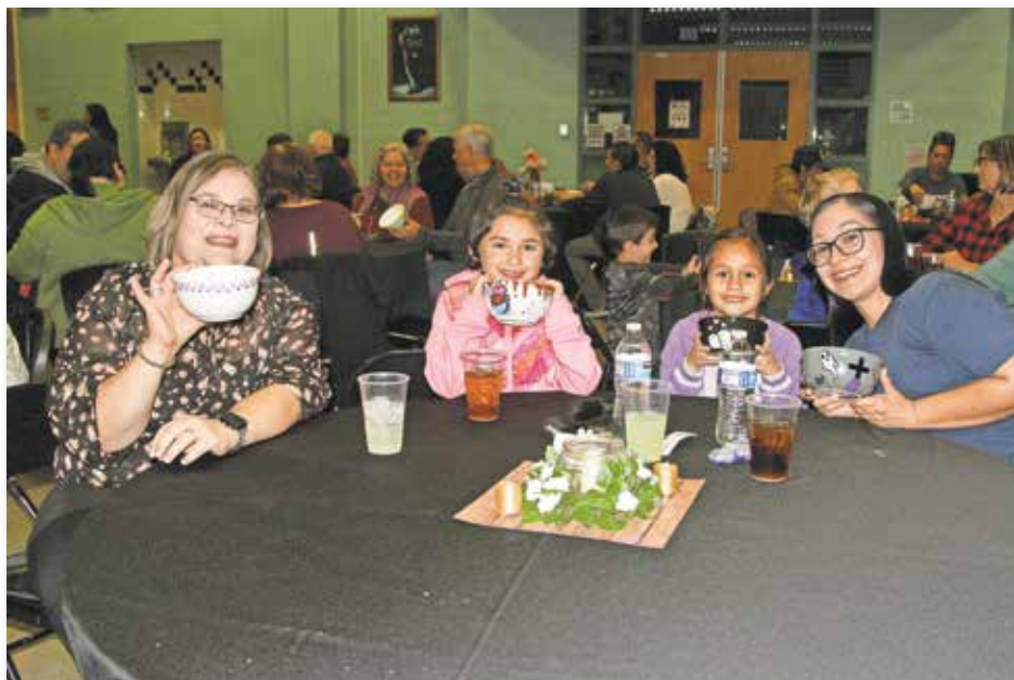
Those attending the Fill-A-Bowl event showed off their chosen bowls hand decorated by members of Superior's FBLA.