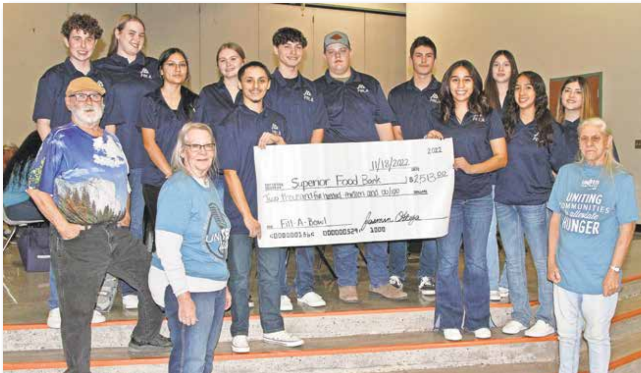
FBLA presenting a check to The Superior Food Bank for $2,513.

He estimates that the group invests around 40 hours of volunteer time to set up, prepare and promote the event, including decorating each of the bowls.