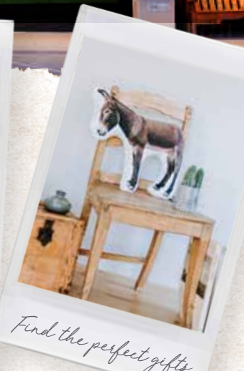
Find the perfect gifts