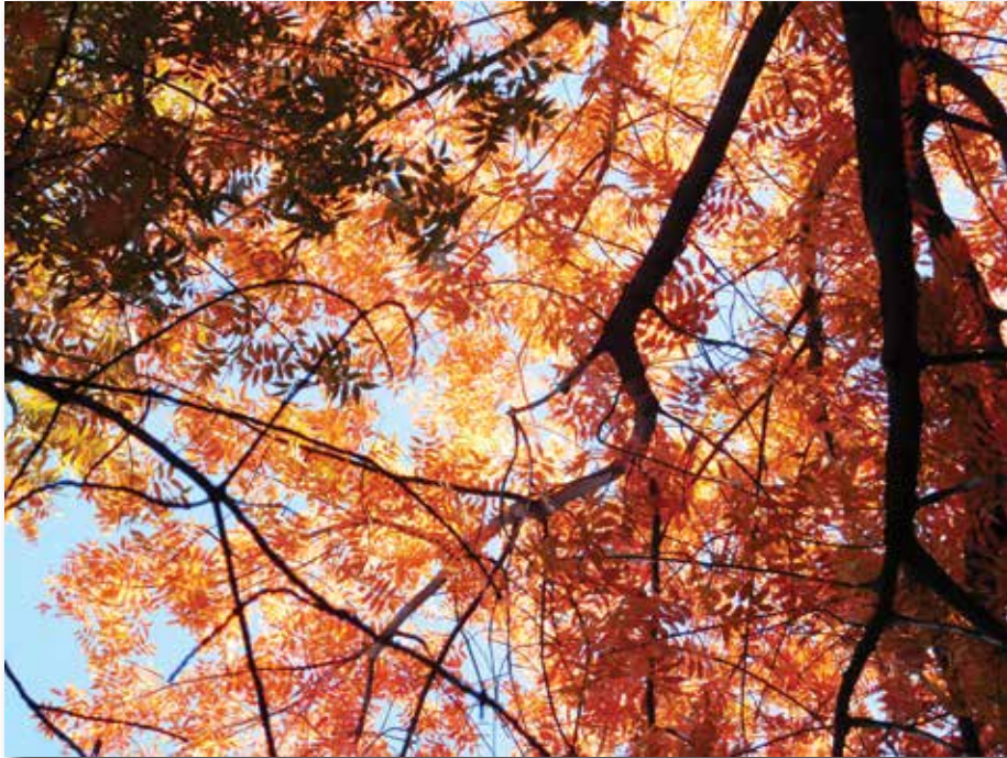
Celebrate Thanksgiving at the Fall Festival at the Arboretum.