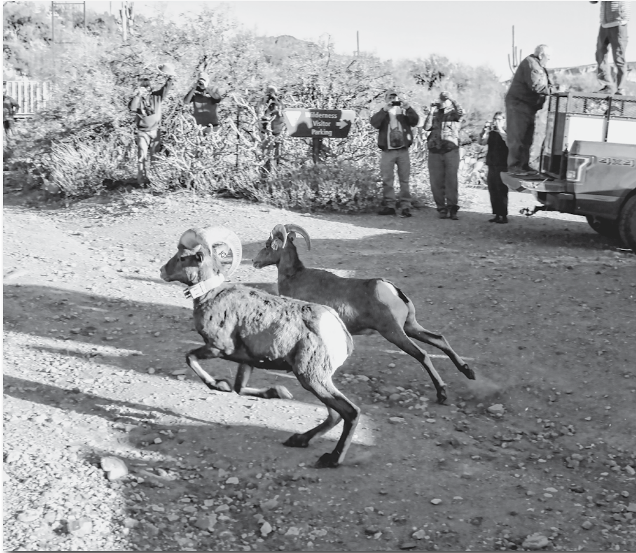
Arizona Game and Fish officials release 11 Arizona Desert Bighorn Sheep into the Aravaipa Canyon Saturday.