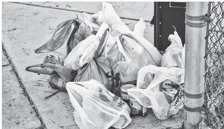
A small portion of the food collected.

The employees plan a similar fundraiser for “Toys for Tots” on December 16.