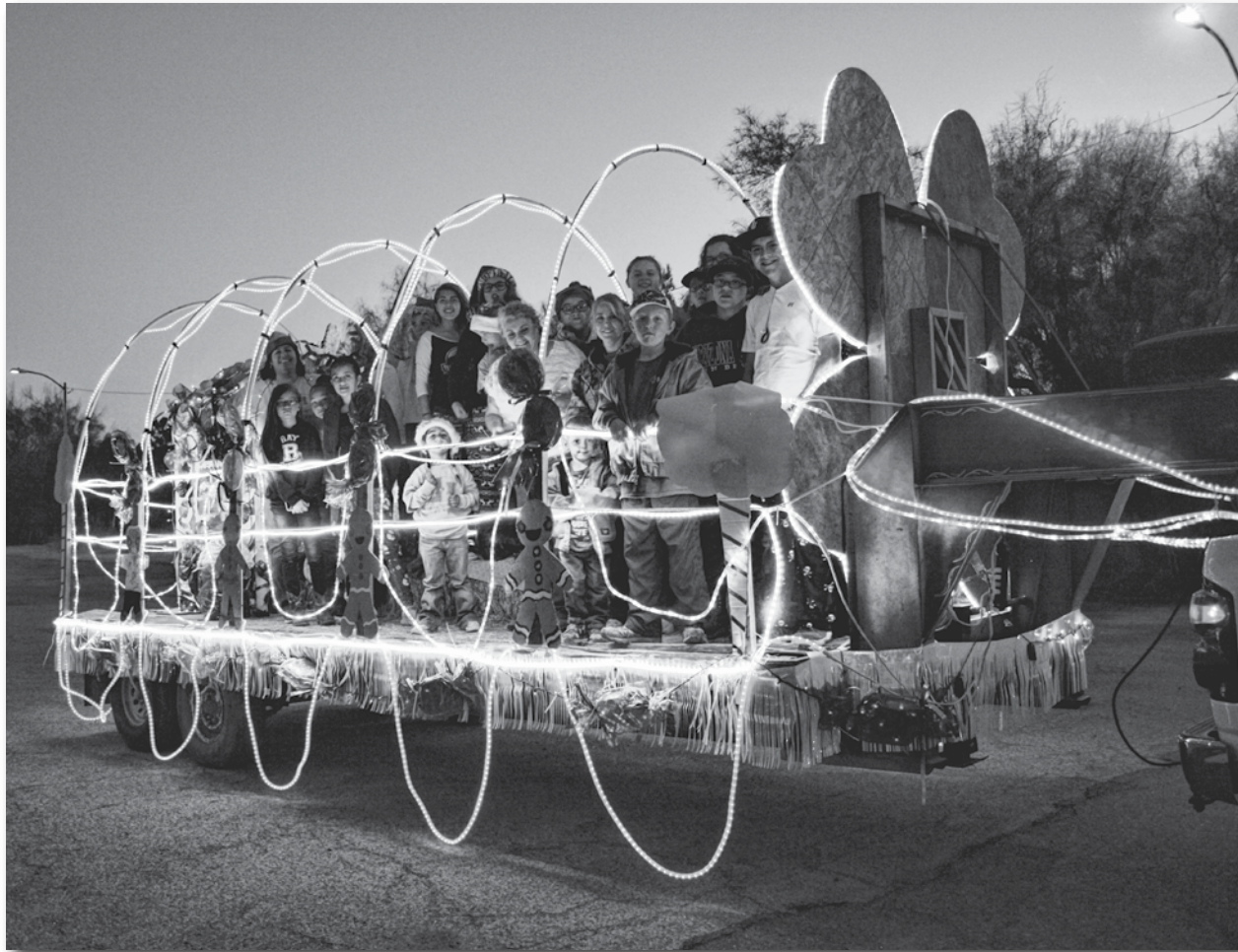
Get your generator tuned up and dust off those lights. It's time to start designing your float for the Winter Wonderland Electric Light Parade, Dec. 3, in Kearny.