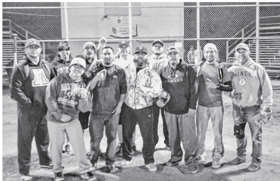
Maintenance 2 were the winners of the Food Drive Softball Tournament.