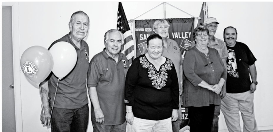
Some of the San Pedro Valley Lions Club members celebrate the club's 70th anniversary.

Although the club membership has dwindled, these wonderful volunteers continue to support the community. Thank you San Pedro Valley Lions Club for 70 years of service to others!