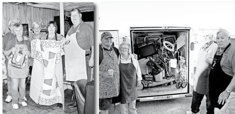
Gifts and durable medical equipment that are headed to the VA Hospital in Tucson.