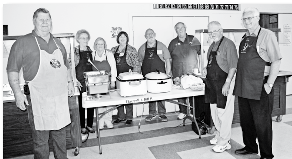
Elks volunteers stand ready to serve up some delicious food at the annual Thanksgiving dinner.

Over $5,000 worth of Christmas gifts has been collected and purchased by the San Manuel Elks Lodge and will be delivered to Veterans at the V.A. Hospital in Tucson. Thank you, San Manuel Elks, for helping our Veterans and supporting our community.