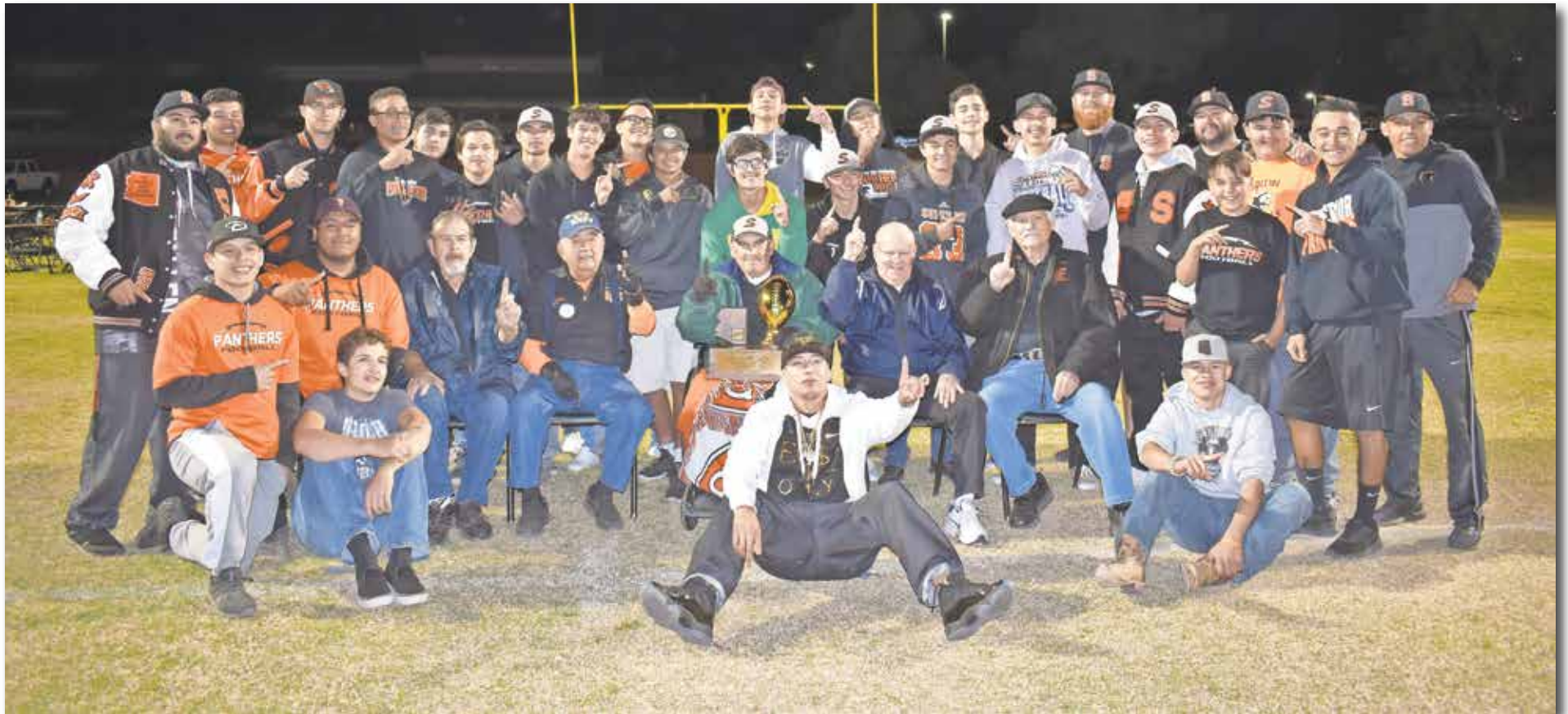
The 2018 Panthers and some of the Superior High School 1954 football champs with the first place trophy.