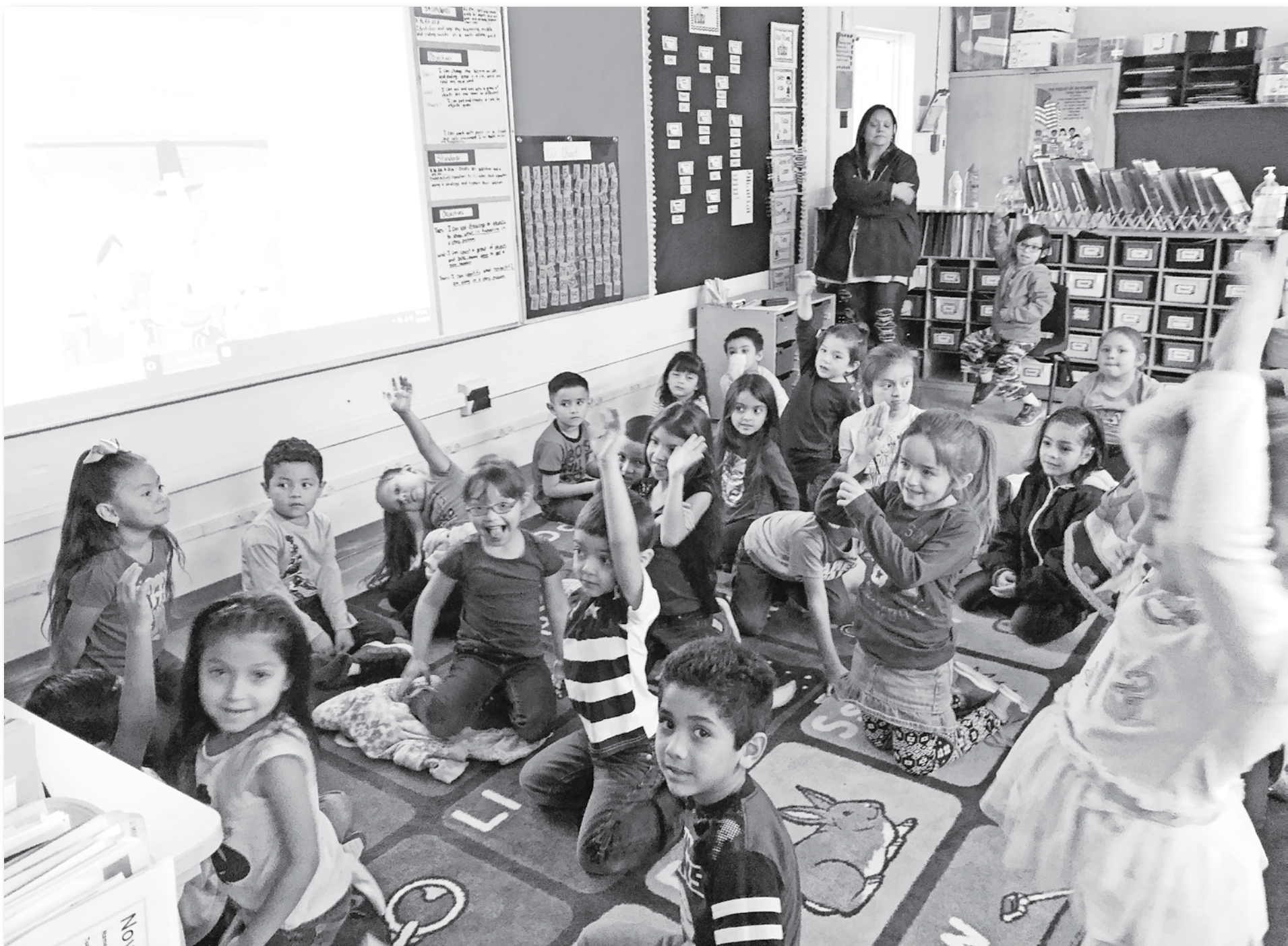
Happy kindergartners learn about the country's first Thanksgiving.

These Kindergartners participated in an interactive video on the Thanksgiving story and all decided that while the Pilgrims may have eaten lobster and seal in their first Thanksgiving meals. They were glad that those were not on their menu, today.