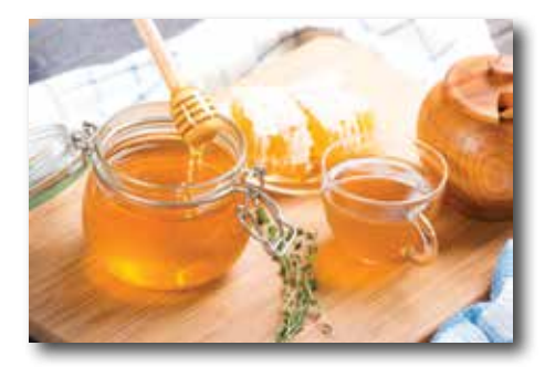
Reach for the organic raw honey instead of the sugar.

canapes and Swedish meatballs, try filling up a plate with crudité first. While you're doing so, get a good look at all the options available. This way, you'll be more likely to savor choice items you'll truly enjoy.