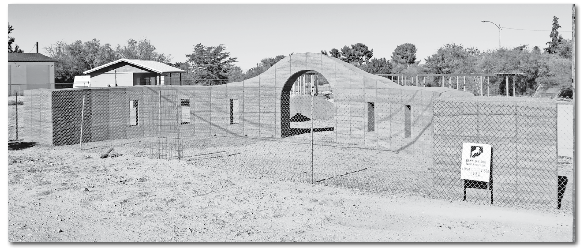
The gateway to the Oracle Community Learning Garden nears completion. It was designed and donated by Rammed Earth Solar Homes.