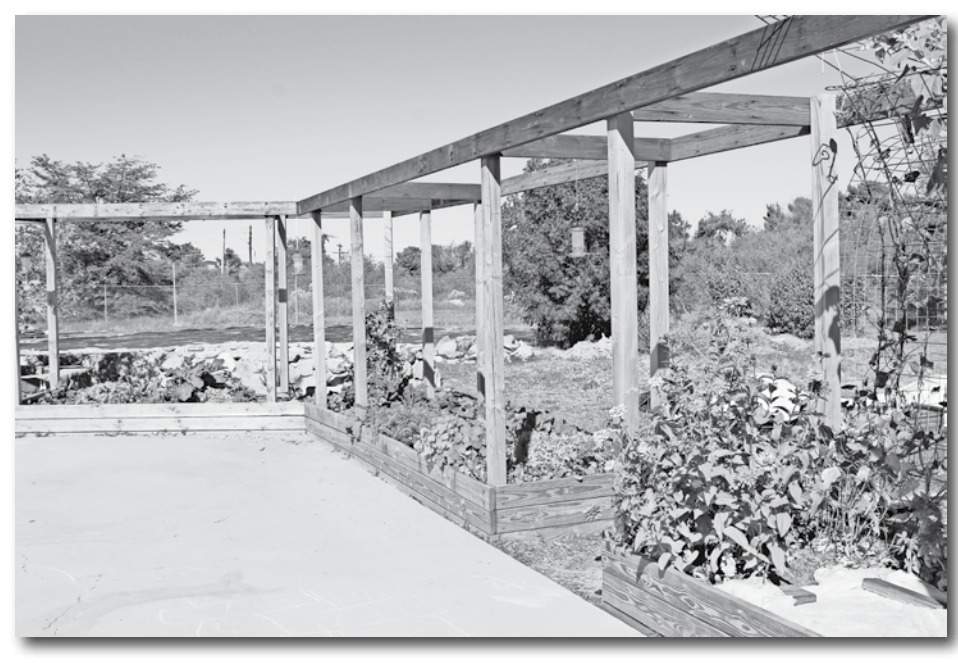
Volunteers built the raised planters, put in fencing and continue to give their time and labor to sustain the garden for the community to enjoy.