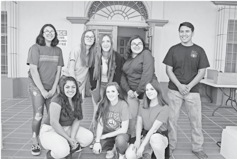
The Copper Basin Junior Chamber of Commerce members were a great help at the Fall Festival and Car Show.