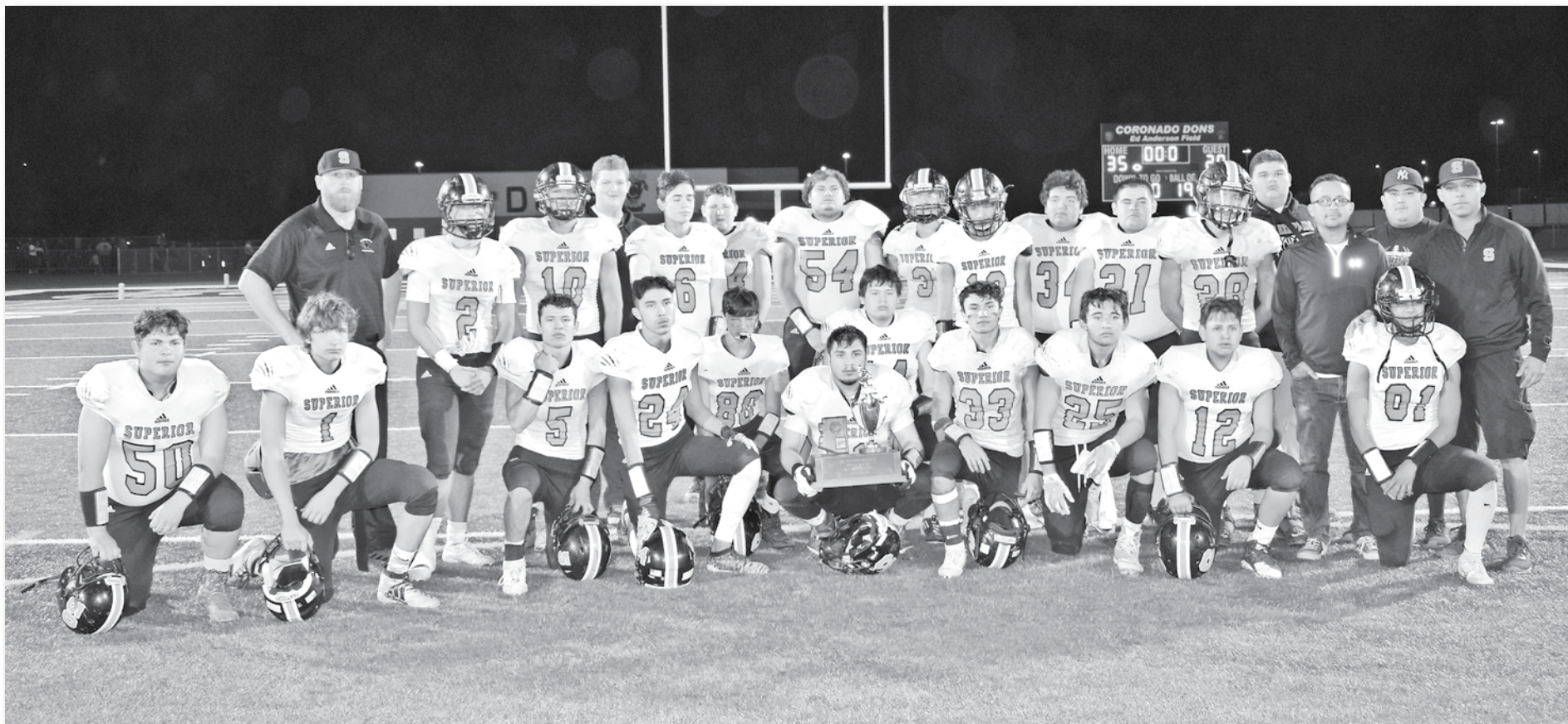
A second place trophy for runners up in the 1A state championship for the Superior Panthers. They are still champs to us.

That would be the best pain relief of all.