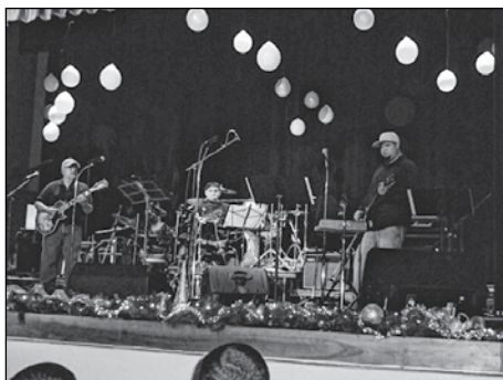
Fathers and Sons