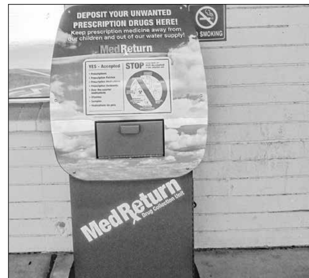
The MedReturn box in the Copper Basin can be found in front of the Kearny Police Department.

Residents can call the police department with questions or for more information.