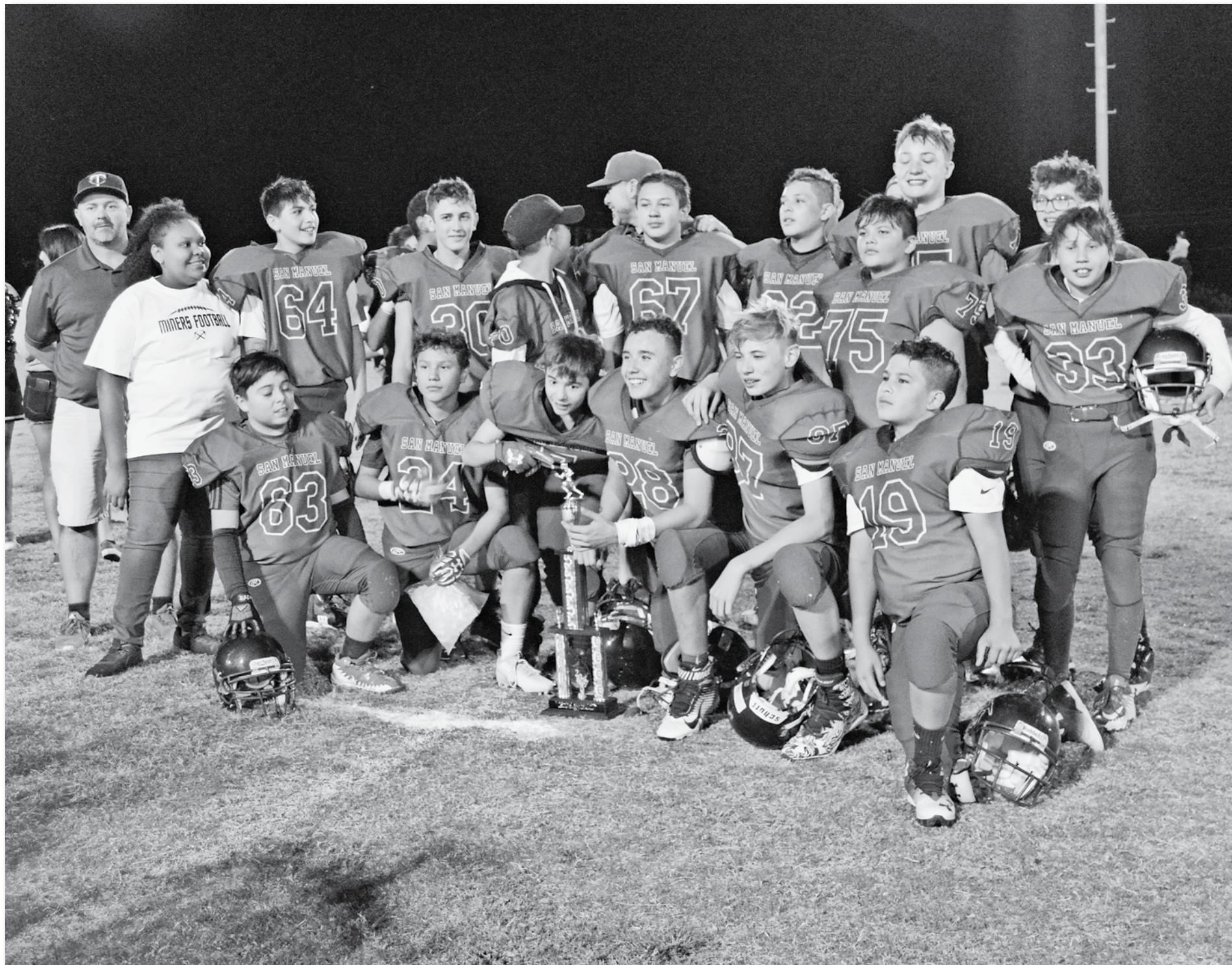
The San Manuel Junior High School Miners are the 2017 Central Junior High League Champions.