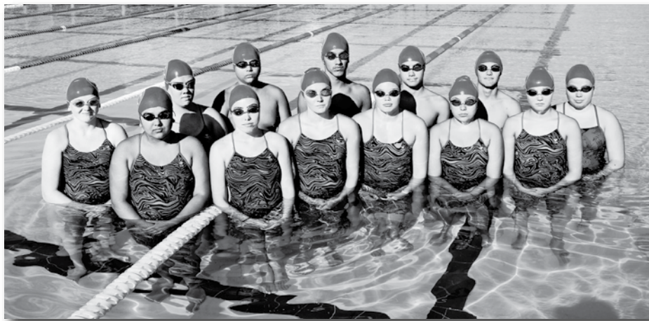
The 2017 Miner Swim Team.

With 3 new school records, and some great individual and relay swims, the Miners look ready to compete in the Division III State Championship Meet. The Division III State Swim Championship will be held at Phoenix Country Day Aquatic Center in Paradise Valley beginning on Friday, Nov. 3 at 3:30 p.m., with Finals scheduled for 2 p.m. Saturday, Nov. 4. Go Miners! #minerpride