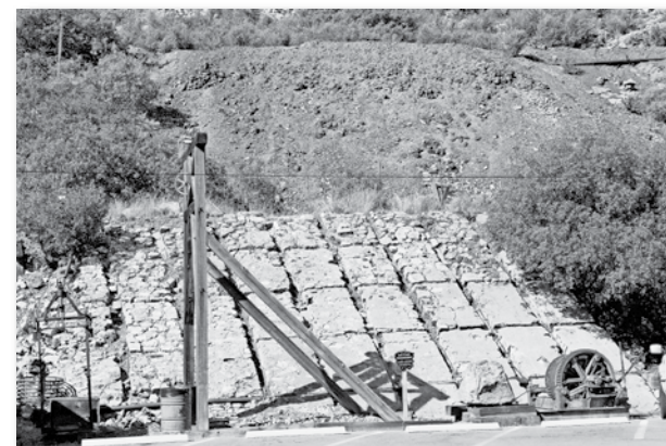
Remaining rock from Copper Queen mine in Bisbee, Ariz. on Sept. 11. Bisbee's Copper Queen mine produced a significant amount of the state's copper until production shut down in 1975.