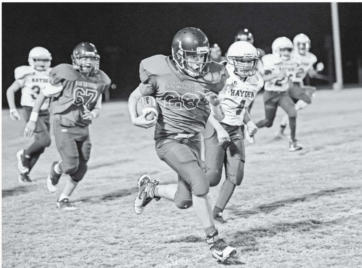
San Manuel and Hayden battled it out last week for the CJHL Football Championship. San Manuel got the win and the first place trophy. Hayden placed second.