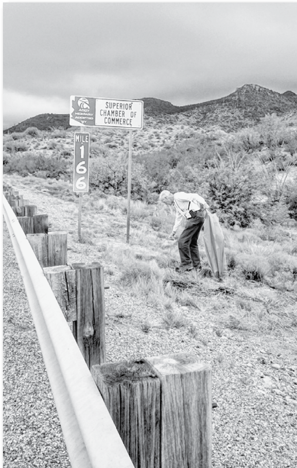
Superior Chamber of Commerce volunteer Bill Vogler collects trash on Hwy. 177 as part of the Adopt A Highway ongoing clean up project.