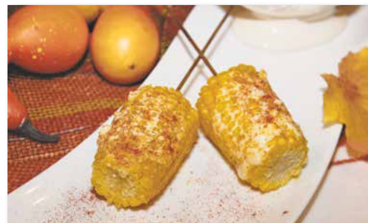
ZESTY CORN Frank Palazzolo www.nonnamarias.com

Add 2 handfuls damp chips on the coals at start of cooking, then a handful every couple of hours during the cooking process. Leave the lid on! Continue smoking until the internal temperature of the turkey reaches 180°F or keep going until the coals die out. Approximately 6 hours (30 minutes for every pound).