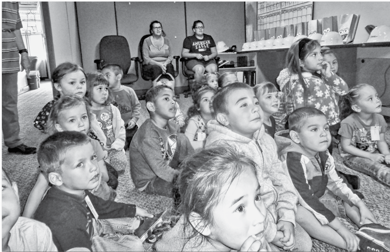
Resolution Copper Company played host to the preschoolers from Superior Head Start.