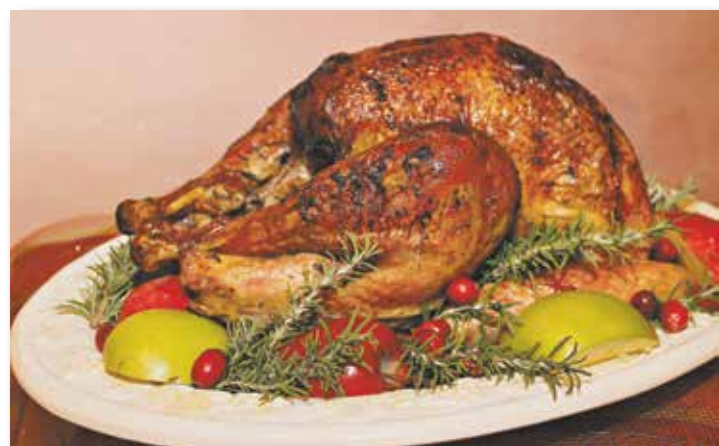
SMOKED TURKEY Frank Palazzolo www.nonnamarias.com