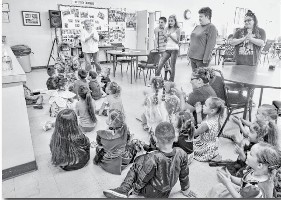
Superior Head Start students made a visit recently to the Superior Senior Center.

Most recently, the children toured the Resolution Copper Company Office and received "safety helmets" as well as a goody bag. They enjoyed viewing the story about Digby. The visit was a school topic which related to school safety. The business community enjoyed listening to the children's comments and ideas.