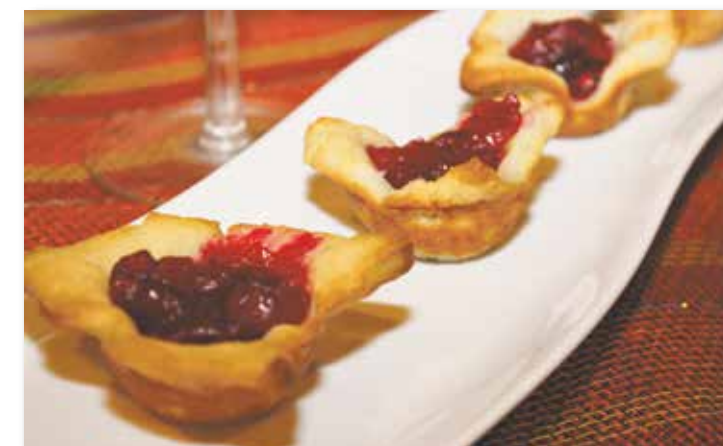
CRANBERRY & CHEESE BITES Frank Palazzolo www.nonnamarias.com

Heat oil in a heavy pot to 365°F. Combine flour, baking powder, salt and sugar. Set aside. Beat together egg, milk, and melted shortening; stir into flour mixture. Mix in the corn kernels and jalapeños. Drop fritter batter by spoonfuls into the hot oil, and fry until golden. Drain on paper towels