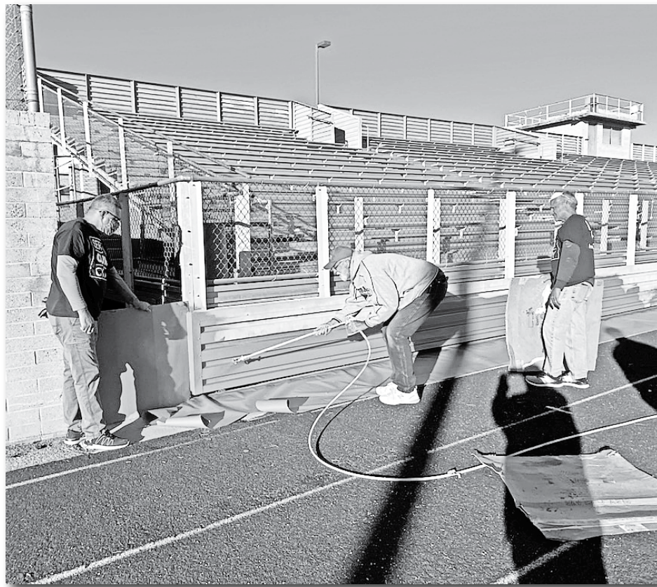
The congregation of Living Word Chapel of Oracle puts a face lift on the Mammoth-San Manuel PreK-12 football stadium. They purchased the paint and supplied the labor spending their Sunday outside the church building serving others. It looks great. Thanks, LWC!