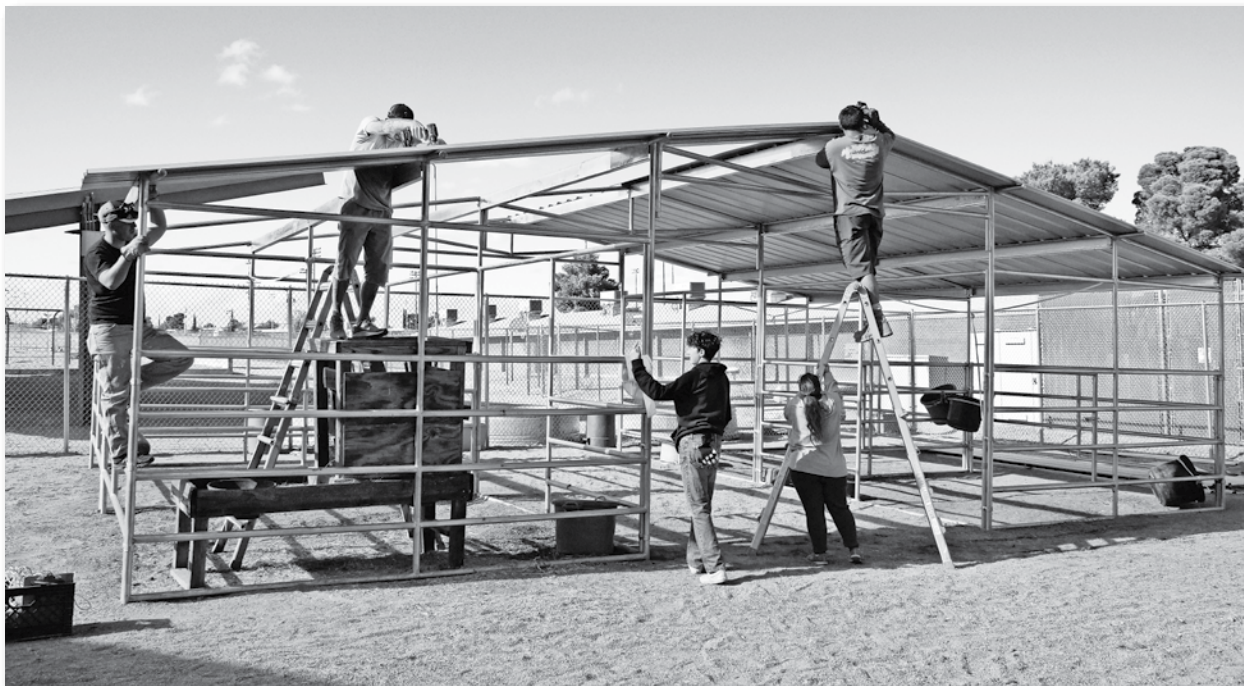
Volunteers work to place the roof over the mare motel at the Mammoth-San Manuel PreK-12 School. It will be used to house cows.