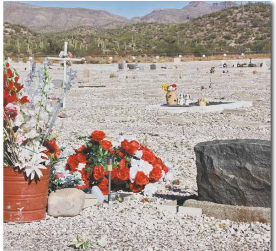
Folks from the Living Word Chapel in Kearny spent time this week cleaning up trash, pulling weeds and beautifying the Ray Memorial Cemetery. Take a look when you drive by. You'll notice the difference.