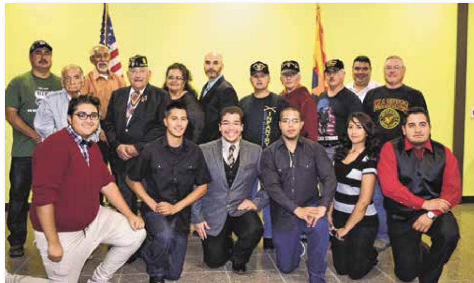
Local veterans were honored by members of the Central Arizona College Student Leadership Organization last week.