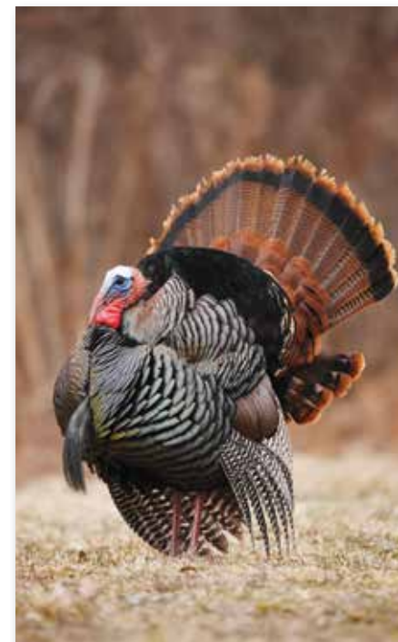
Manuel Miner and Copper Area News wishes you an extra special Thanksgiving!

From our family to yours, everyone at the Superior Sun , Copper Basin News , San