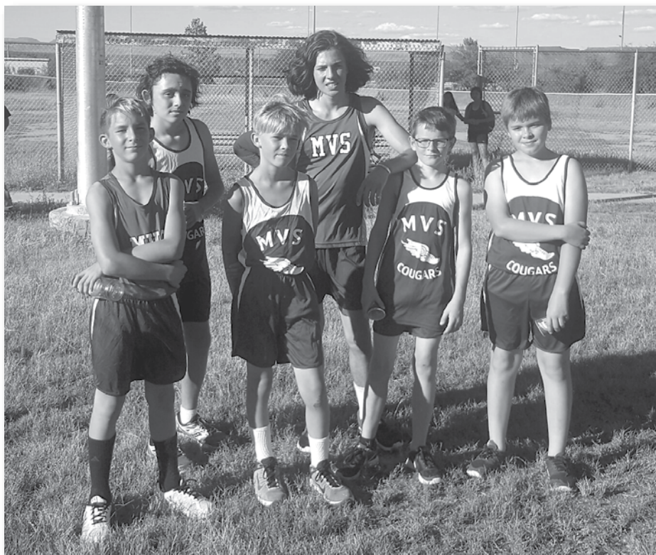
Inaugural cross country team at Mountain Vista School.