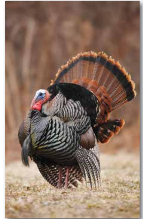
Manuel Miner and Copper Area News wishes you an extra special Thanksgiving!

From our family to yours, everyone at the Superior Sun, Copper Basin News, San