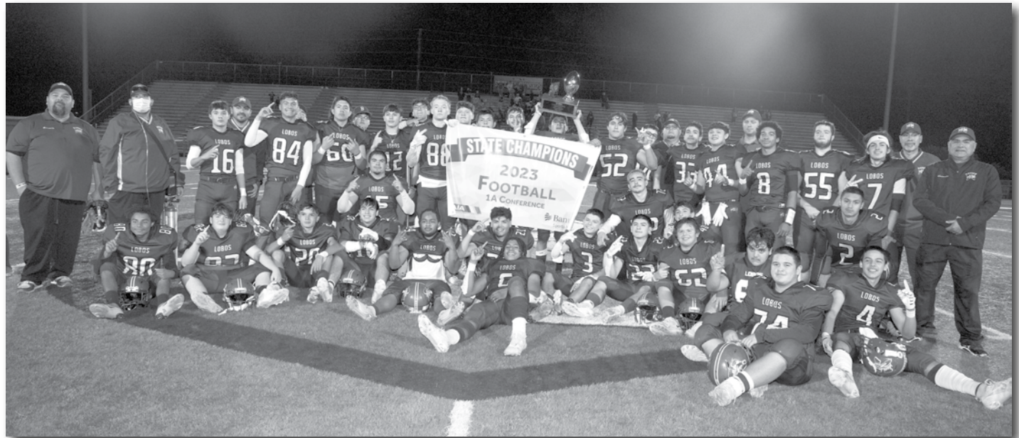
The 2023 Hayden High School football team celebrates their victory Saturday night over Mogollon.

The Lobo defense continued to put pressure on the Mustangs. Mogollon slowly moved down the field, then scored a touchdown and 2-point conversion,