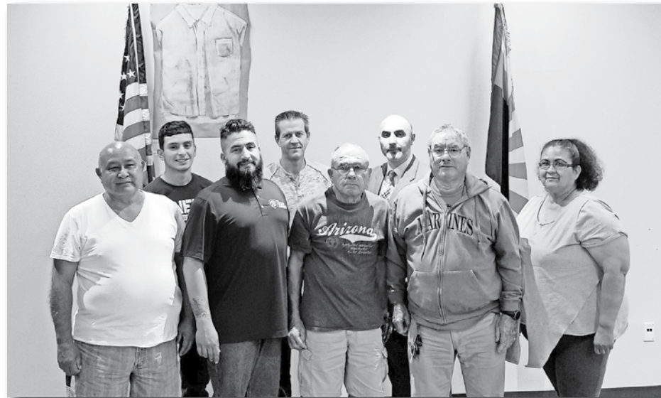
CAC Aravaipa honored Veterans at its annual ceremony last week. All of CAC's campuses hosted events recognizing Veterans.