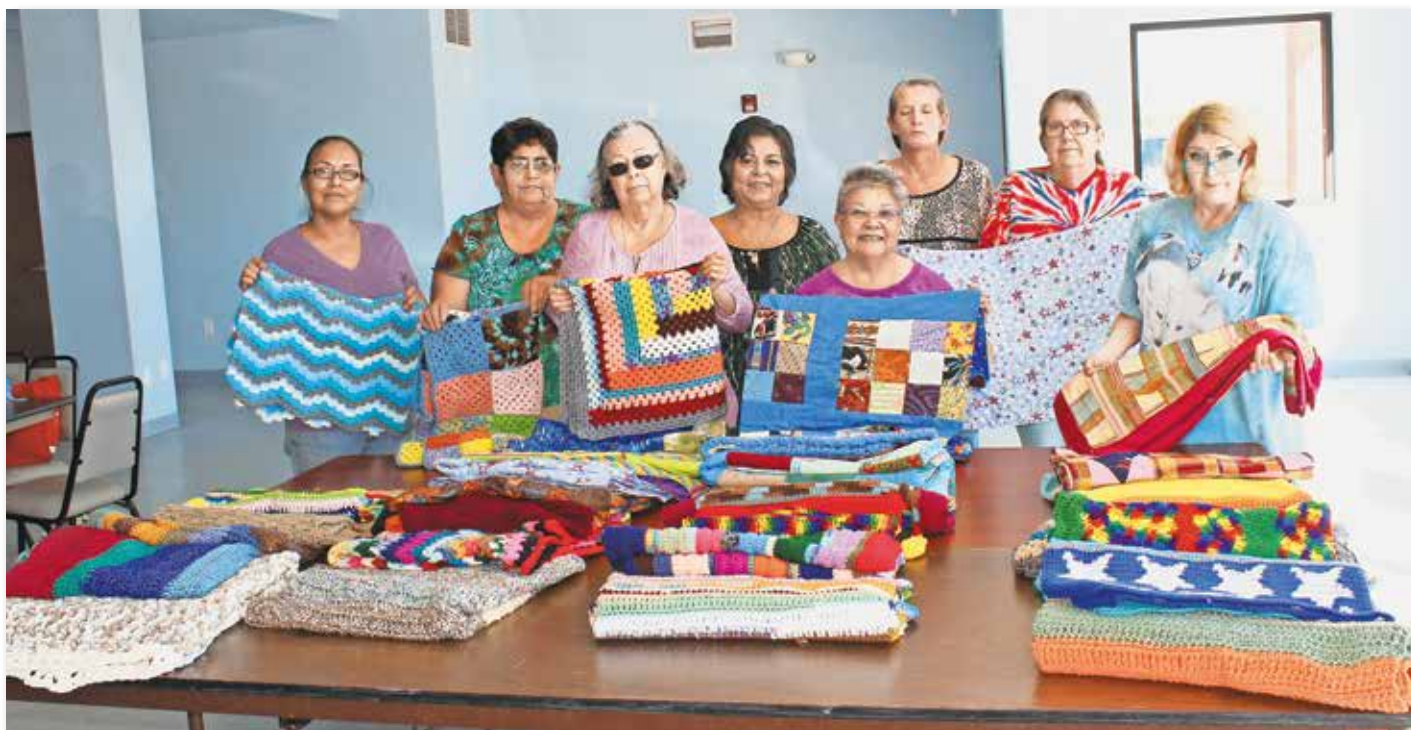
Volunteers with the San Pedro Valley Needle Group display various quilts and afghans that will be given to the VA Hospital.