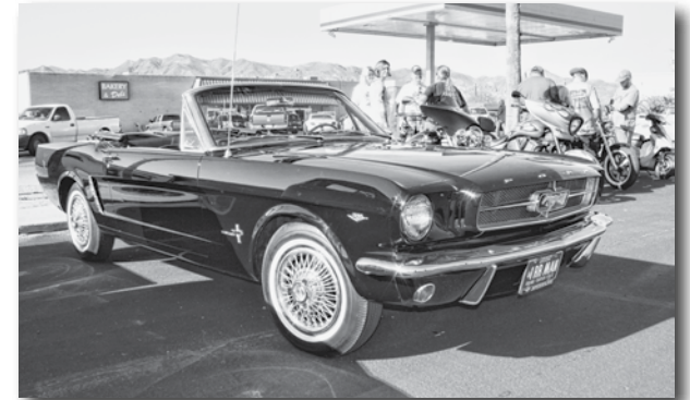
Just one of the gorgeous cars at last year's K-Town Car Show and Fall Festival.