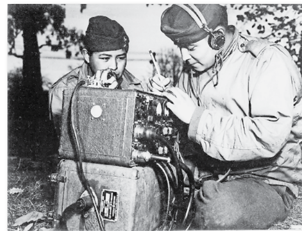
Code Talkers at work, Australia, July 1943.

Following the end of World War II, many Native American Veterans benefitted from the G.I. Bill and furthered their education. A number of them began