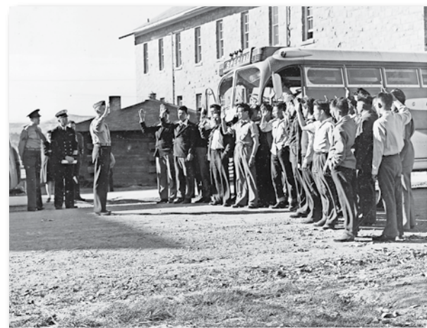
First 29 Navajo U.S. Marine Corps Code Talker recruits being sworn in at Fort Wingate, NM.

In the 1990s, it was estimated that there were 160,000 Native American Veterans. This comprised 10 percent of the Native American population, three times the proportion of non-native people that have served in the military. The Native American has played an important part in the history of the United States military. Let us honor their service and all Veterans.