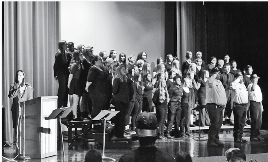
The Choir and Honor Guard at the annual patriotism assembly at the San Manuel High School Auditorium.

On Thursday, last week, the Mammoth-San Manuel School District hosted its annual salute to Veterans. Students spoke about what patriotism means to them and the choir performed as well.