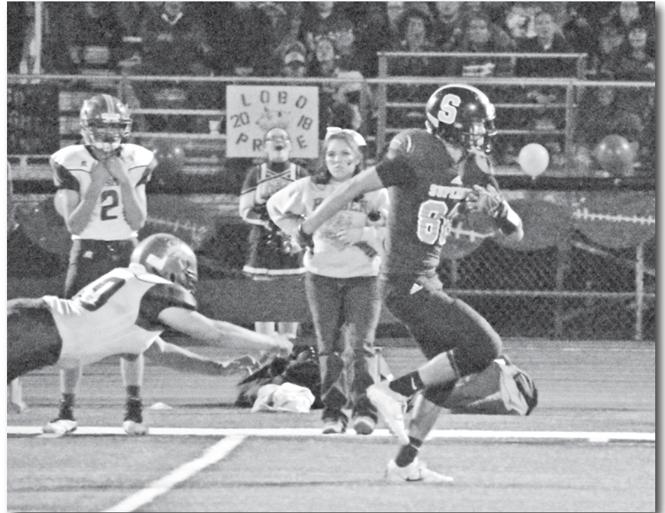
A Hayden defender goes vertical, just missing the Panther ball carrier.