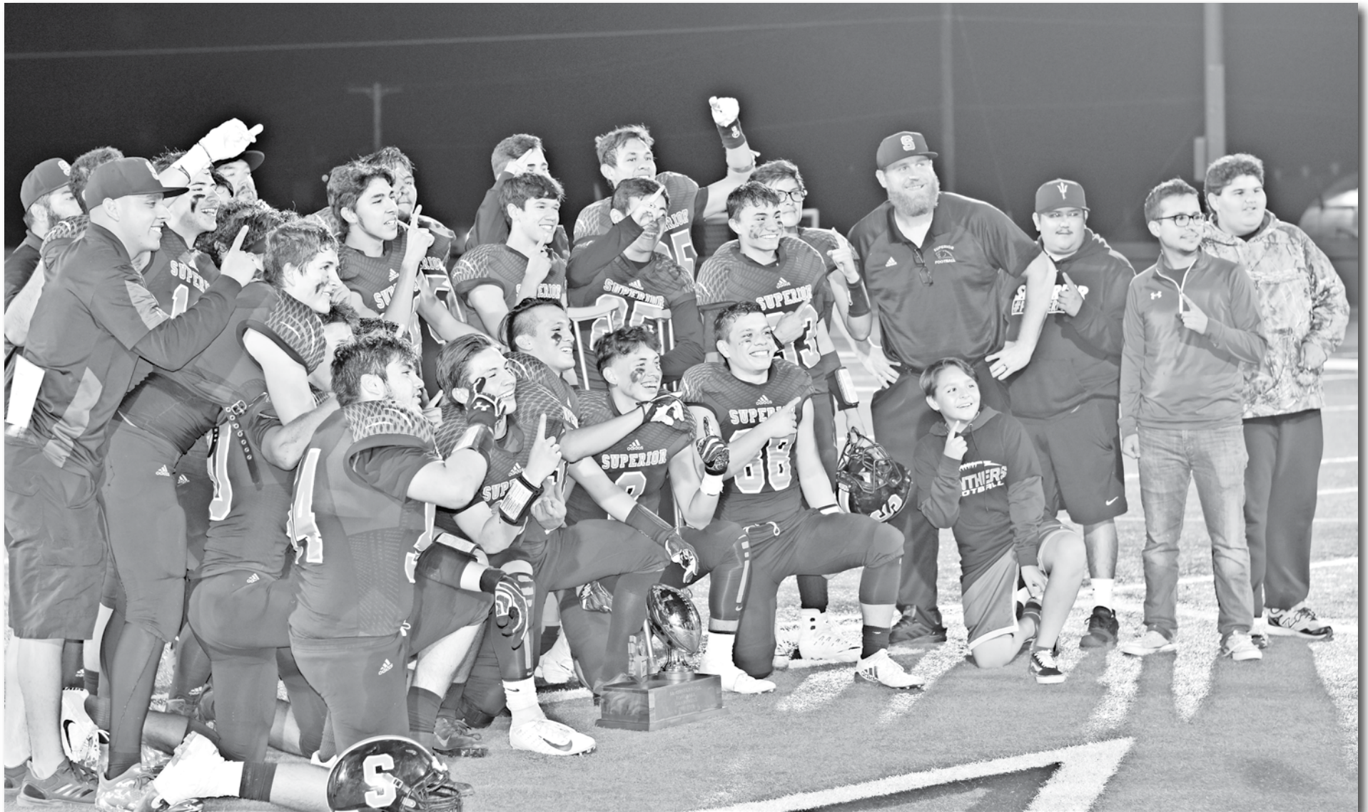
The 1A State Champions, Superior Panthers, pose with the trophy. Superior hasn’t won a championship since 1957.

Good things come to those who wait...and work for it.