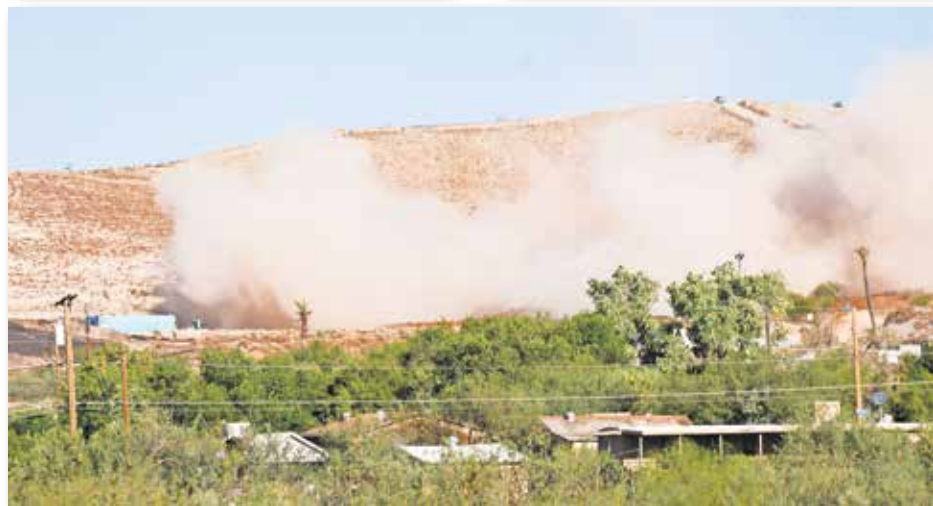
The Magma Smokestack in Superior came down at 9 a.m. on Saturday, Nov. 10.