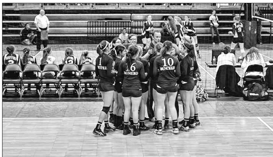
Coaches talk to the 'Cats prior to their first round game against Joy Christian in the 2013 AIA Division V State Volleyball Tournament at Tim's Toyota Center in Prescott, Arizona.