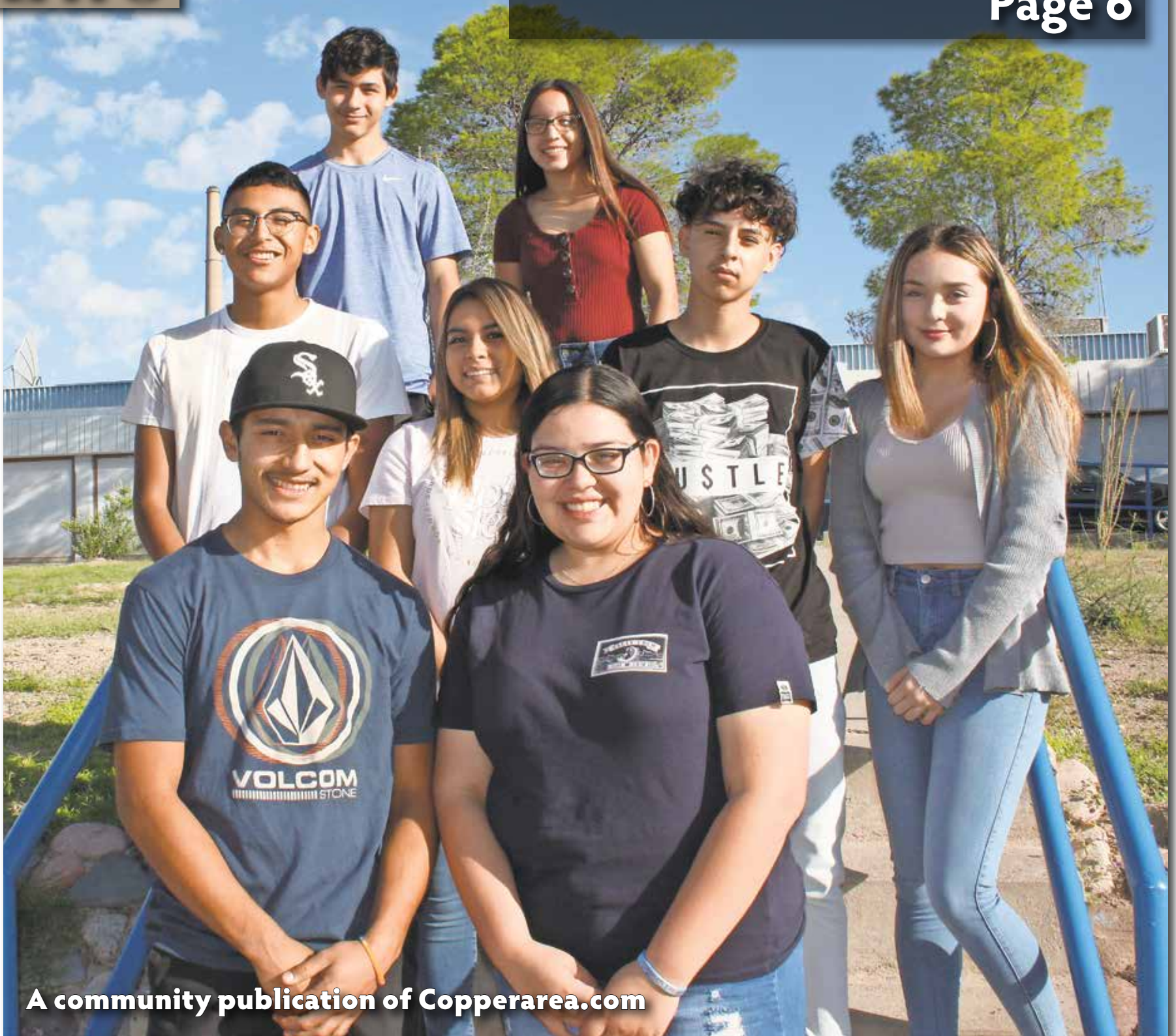
James Carnes | Copper Basin News