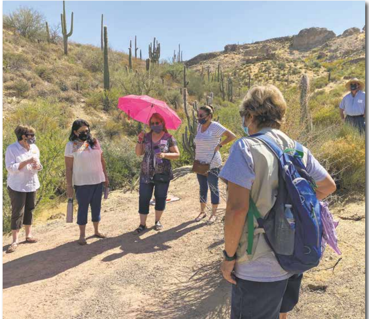
Walking the trail at the Boyce Thompson Arboretum is a great way to stay socially distant. With the Wallace Garden open, new trails are available to visitors.

You can book a guided tour of the garden by visiting the Boyce Thompson Arboretum webpage: https://www.btboretum.org/wallace-desert-garden . The Boyce Thompson Arboretum is also hosting its annual Fall Plant sale starting this weekend; members do receive a discount and there are a variety of membership options including a "Neighborhood" membership.