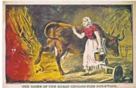
The O'Leary's Home and Farm

Arizona Families are coming together to protect our health care.