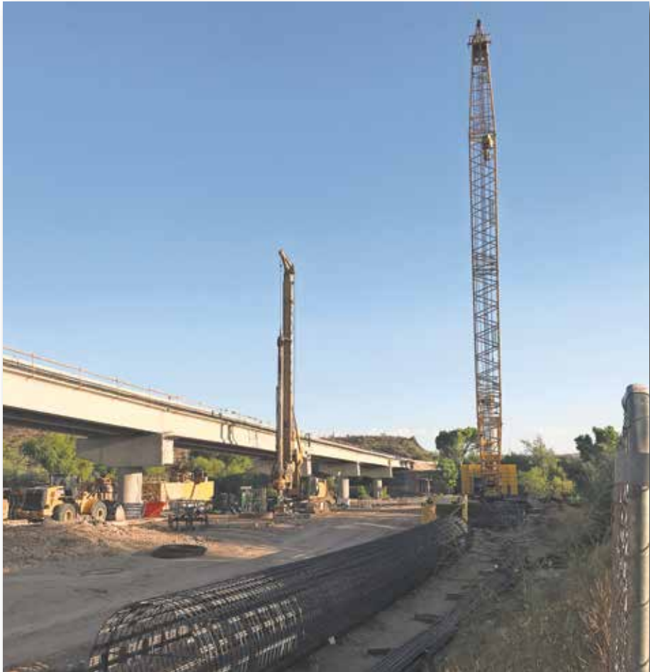
Construction on the second half of the Winkelman Bridge continues. Most drivers can't wait until it's finally complete.