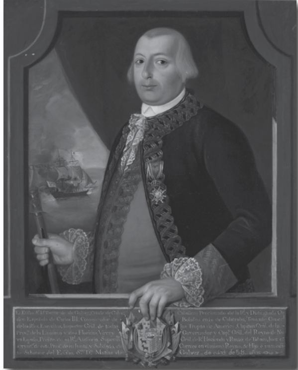
Portrait of Bernardo de Gálvez

H ispanics have honorably served in all the military branches of the United States. More than 300,000 Latinos enlisted in the armed forces during World War II. It is estimated that 3,070 Hispanics died in the Vietnam War. Latinos earned 14