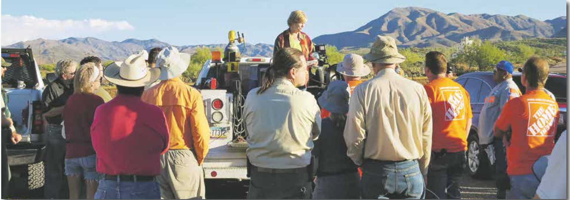
Volunteers receive instructions before heading out into the desert near Superior to clean.

combat illegal dumping in the forest. Local companies, Resolution Copper, Odonetto Construction, and OMYA assisted with roll offs, volunteer staffing along with heavy equipment use and operators.