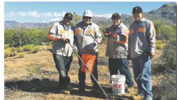
About 40 volunteers headed into the desert south of Superior to clean up after wildcat dumpers.