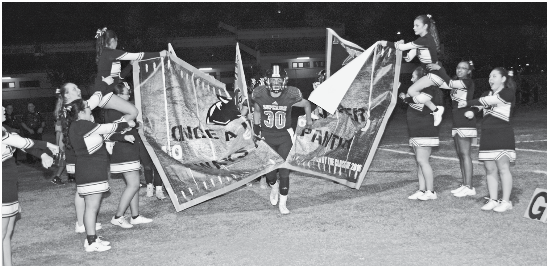
The Superior Panthers take the field for Homecoming.

Those sound like the words of a confident head coach. Kickoff for Friday's game is scheduled for 7 p.m.