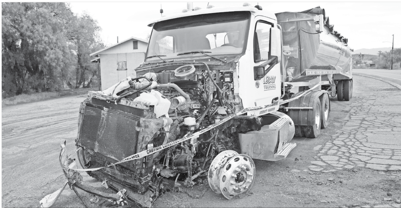
The semi was towed from Winkelman to Hayden and the parking lot of Eddie Tire following a fatal accident Monday.