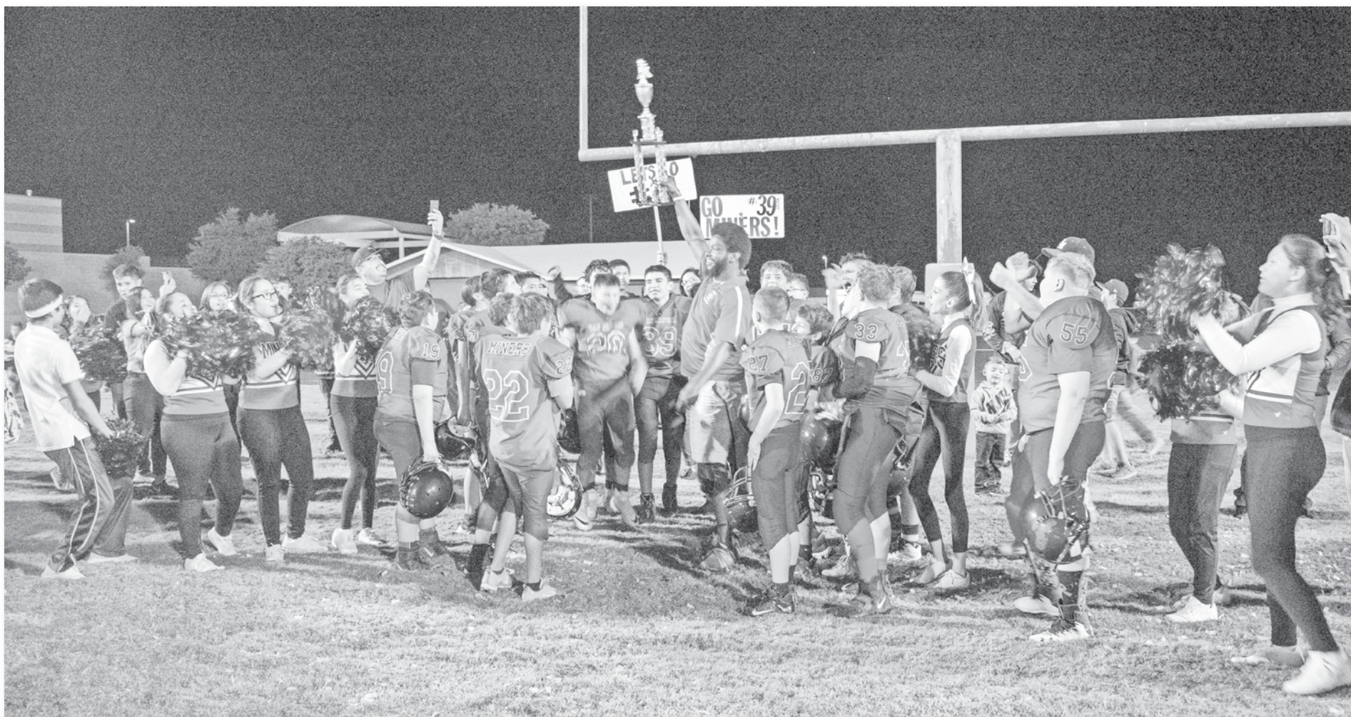
San Manuel Jr. Miners earn their third CJHL championship.