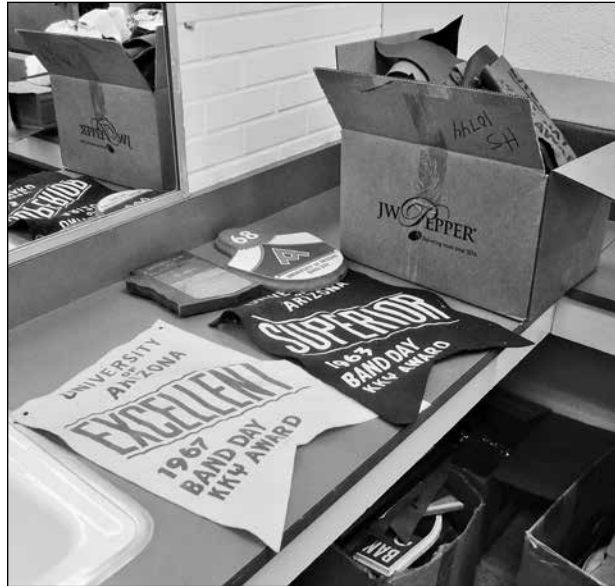
Banners will again be shown as the result of the special project to exhume the history of the RHS band program.