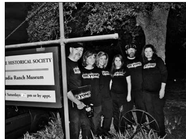
Beyond-Paranormal spend their time looking for the evidence of ghosts.