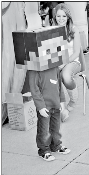
The ultimate in incognito wear.

See more online at http://bit.ly/1gar35l