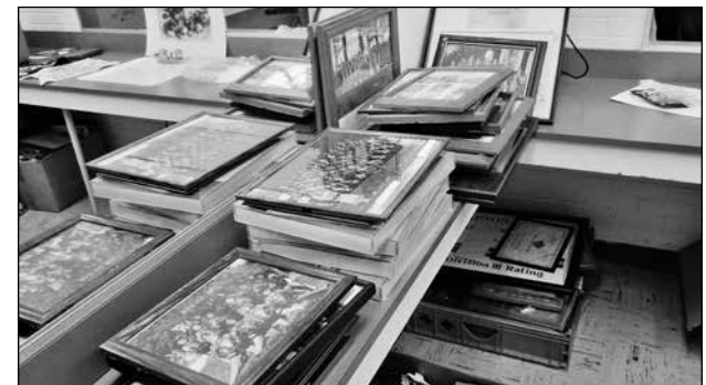
These pictures of RHS Bands will be part of the display in the band room showcasing the program's past and offering a sense of pride and motivation for the future.

For up-to-date tournament information and pairings, please check the Arizona Interscholastic Association website referenced above. The Copper Basin News will follow the 'Cats and provide tournament coverage of their quest for the state championship.