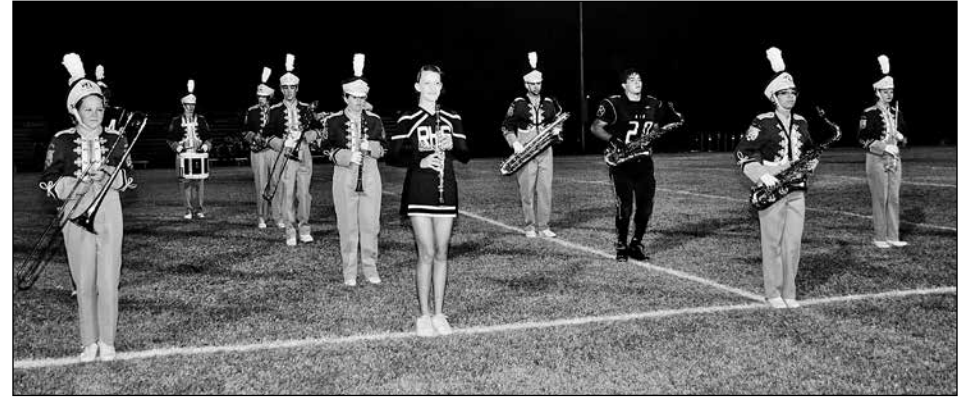
Band, cheer and football uniforms dot the field as the RHS Marching Band takes the field.

band is holding several fundraisers including a