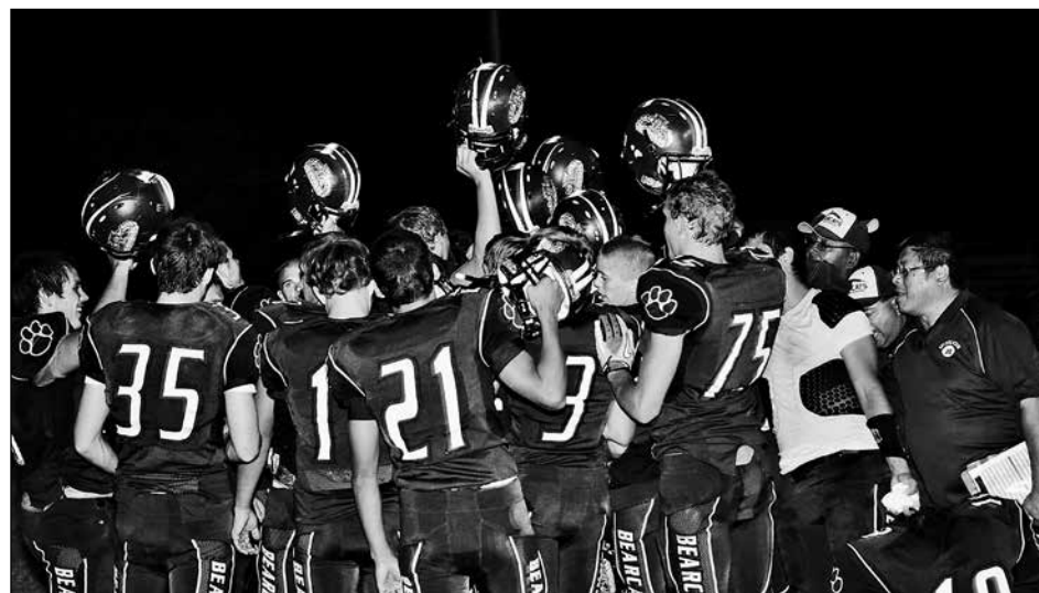
The Bearcats celebrate their win over the Duncan Wildkats.

The Bearcats will put their defense to the test in the second round as they take on the undefeated number 2 seeded Gilbert Christian Knights this Saturday night at 6 p.m. in Gilbert. The address to the school is 3632 E. Jasper Drive Gilbert, AZ 85296. It is sanctioned by the AIA so ticket prices will be $8 for seniors/adults and $6 for children. This is the Bearcats second step towards a state title so come out and show these young athletes your support. Good Luck Bearcats!