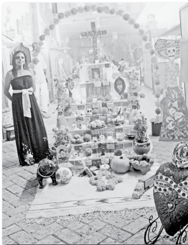
An altar for Dia de los Muertos.

The Oracle Historical Society is looking for local artists or those with experience to create altars/ofrendas for