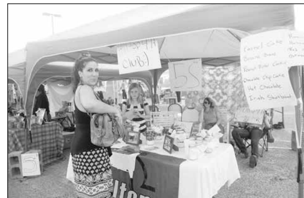
Local youth organizations used the Taste of Oracle event in 2012 to raise funds for activities.

The mission of the Tri-Community Visitors Center is to “encourage residents and visitors to discover the beauty, art and amenities of the Tri-Communities.” The center provides information about