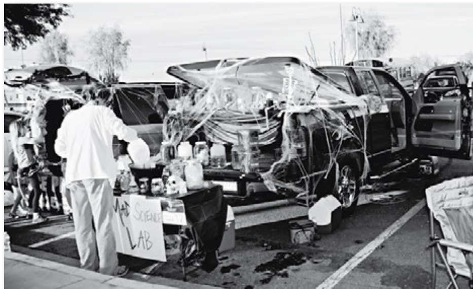
No more 'Trick or Treat' – It's Trunk or Treat now.