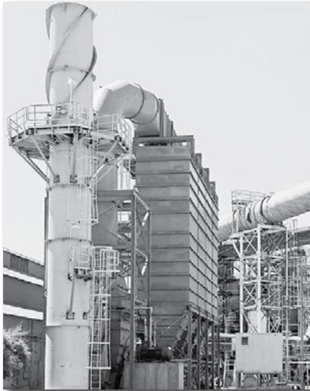
The EPA held hearings in Hayden last week to help inform the public about the new safety requirements being implemented and how they will affect local employer Asarco.