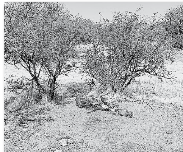
Arizona Game and Fish are looking for the person who killed this mule deer doe near Dudleyville.

352-0700, or visit www.azgfd.gov/ogt , and refer to case #20-003293. Callers may be eligible for a reward of up to $1,500 for information leading to an arrest in this case. All calls will remain confidential and reports can be made anonymously if needed.