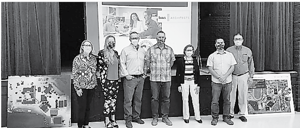
Members of the Oracle School District's design and construction partner firms: BWS Architects, Chasse Building Team, and the H2 Group.